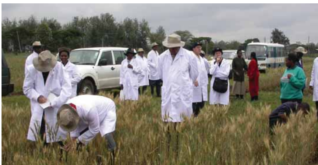
Figure 3: Participants to the Nairobi Summit visiting the Ug99 disease international nursery in Njoro, Kenya (2005)

BGRI partners have been active in developing projects both jointly and independently to obtain funds in support to help countries manage the Ug99 crisis. Apart from its own funds, BGRI has obtained funds from the United States Agency for International Development, the Canadian International Development Agency, the Indian Council of Agricultural Research, the Arab Fund for Social and Economic Development, the International Fund for Agricultural Development (IFAD) and Cornell University.