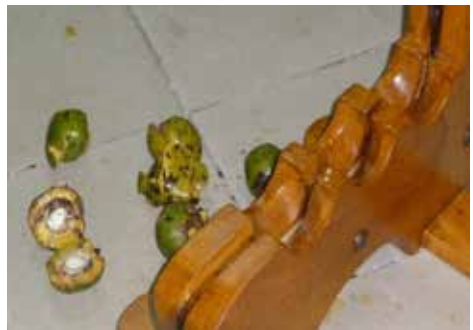
Photo 2. Processing technology: Bush mango cutting machine