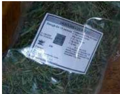
Photo 4. Dried eru packaged by processing enterprise MISPEG in Cameroon