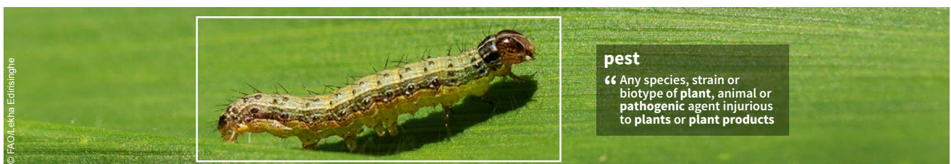
A close-up of a Fall Armyworm ( Spodoptera frugiperda ) infesting a maize crop in the North Central province of the Democratic Socialist Republic of Sri Lanka.