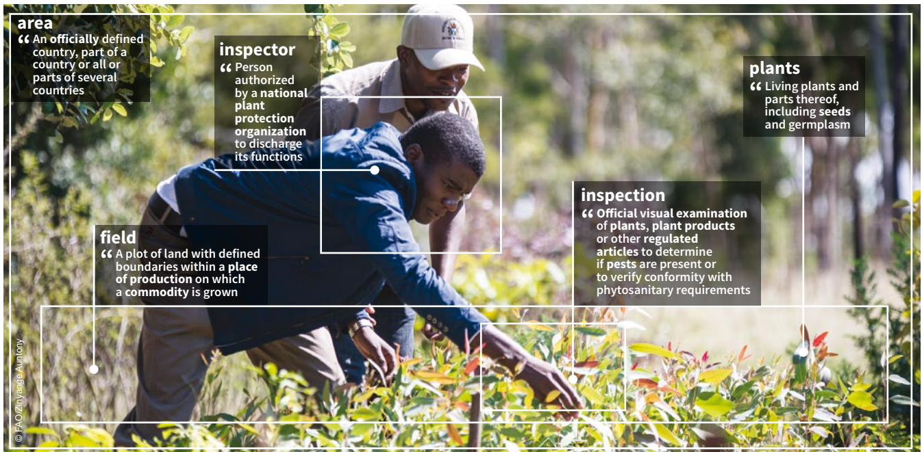
Forestry researchers inspect trial eucalyptus seedlings at a nursery in the Republic of Zimbabwe.