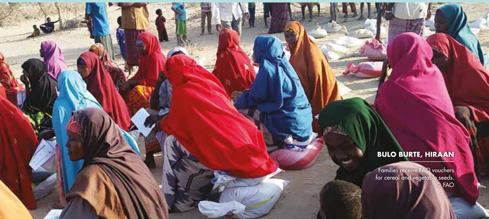
BULO BURTE, HIRAAN

Families receive FAO vouchers for cereal and vegetable seeds.