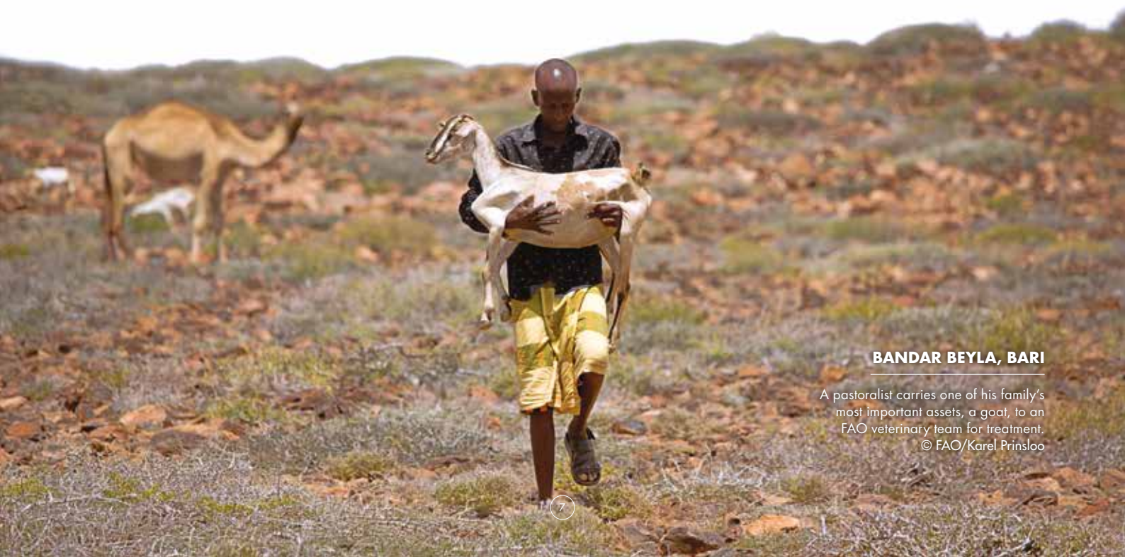
BANDAR BEYLA, BARI

This activity is people-oriented – improvements to efficiency ultimately mean more lives saved or put on a path to greater prosperity. It also allows us to reassure donors supporting our work that they are getting strong value-for-money on their humanitarian investments.