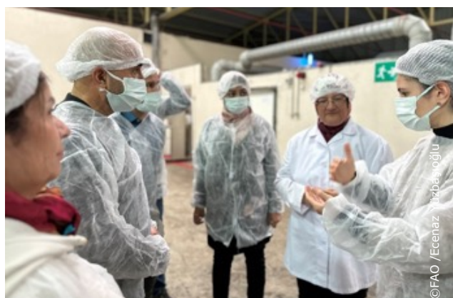
Participants visiting fig storage and processing facilities of Tariş Cooperative.

Türkiye recently launched the One Country One Priority Product (OCOP) initiative in cooperation with FAO, designating figs as a special agricultural product. The national launch event, held on 7–8 December 2023 in Aydın, Türkiye, featured the participation of various stakeholders, including government officials, members of academia and industry representatives. Keynote presentations outlined the global progress of OCOP, with a focus on fig development in Türkiye. The event emphasized strategic collaboration to strengthen the fig sector and included practical discussions on exporting processed fig products. The success of the launch signifies a transformative step in Türkiye's commitment to sustainable agrifood systems. Participants also visited the Fig Research Institute and fig-drying facilities, gaining insights into industry best practices. OCOP aims to promote inclusive and sustainable food systems by developing Special Agricultural Products and addressing gaps in the value chain.