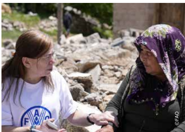
The ERRP provides assistance to victims of the February earthquakes in Türkiye.

These initiatives align with comprehensive strategies recommended in the Agriculture Sector Needs Assessment for Earthquake-Impacted Provinces, highlighting the necessity of support in the form of inputs, reconstruction, and inclusive recovery for a sustainable agricultural sector. In addition to these interventions, the sustainable recovery of 885 smallholders is supported through the enhancement of technical skills, encompassing climate-smart agriculture and best practices in agriculture, facilitated through Farmer Field Schools.