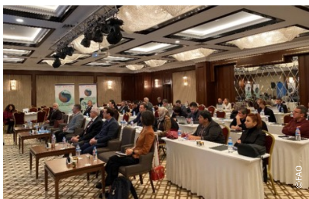
FFS Curriculum Workshop held in Ankara.

Within the scope of the Land Degradation Neutrality Upper Sakarya project, a Farmer Field Schools Curriculum Workshop was held in Ankara on 13–14 December. During the workshop, experts contributed to discussions on the topics of training to be delivered to farmers. In 2022, four Farmer Field Schools were established and implemented in conjunction with the Ankara, Kütahya and Eskişehir provincial directorates. These four schools focused on irrigation, animal husbandry and greenhouse cultivation, reaching 97 farmers, 47 of whom were women. In the upcoming period, farmers attending the four schools will receive training in greenhouse farming, including pasture farming, contracted fodder pea production and cut flower production.