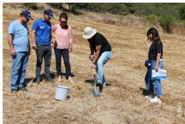
Over 50 participants received training including technical personnel, representatives of NGOs and farmers.

As part of the project “Enhancement of Agro-Ecological Management Systems through Promoting Ecosystem-Oriented Food Production”, practical agro-ecological training sessions were provided to district farmers in the Seben and Yeniçağa districts of Bolu, including detailed explanations on how and when to collect soil samples. The training was attended by over 50 participants including technical personnel, representatives of NGOs and farmers. Following the theoretical sessions, soil samples were collected with farmers from 17 different locations districts to create pilot demonstrations for agro-ecological practices.