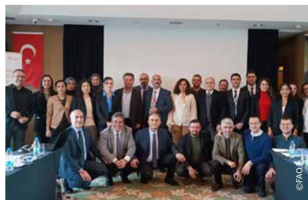
Workshop participants in Ordu from Tajikistan, Türkiye and Uzbekistan.

As part of the project "Leaving no one behind: Greater involvement and empowerment of rural women in Türkiye and Central Asia", a two-day regional workshop, held in Ordu on 13–14 December 2023, brought together participants from ministries and government institutions of Tajikistan, Türkiye and Uzbekistan. Within the scope of the workshop, government officials working in agriculture, forestry and food security shared experiences from their organizations related to socially inclusive and gender responsive policies and practices that address the needs of rural women at a risk of being left behind. The workshop also included visits to gender units created by MoAF and meetings with rural women benefiting from the programme.