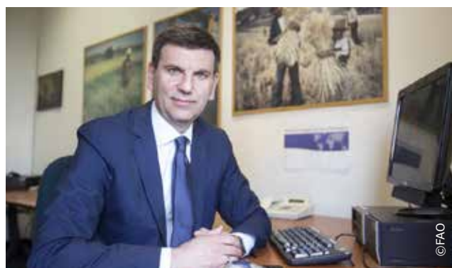
Viorel Gutu , Subregional Coordinator for Central Asia, FAO Representative in Türkiye.

In response, the Food and Agriculture Organization of the United Nations (FAO) mobilized all existing resources and capacity to support recovery efforts in the region, working in close cooperation with relevant institutions to ensure that all efforts build on sustainable and resilient practices designed to contribute to the continuation of agricultural production and ensure food security.