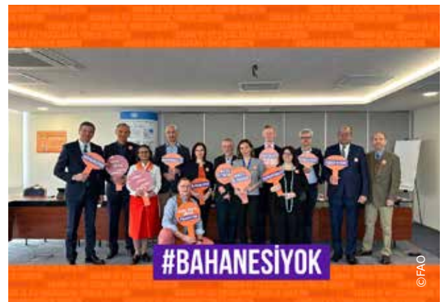
The UN Türkiye team joined forces to participate in the 16 Days of Activism.

During the 16 Days of Activism campaign, UNCT members and Viorel Gutu, Sub-Regional Coordinator for Central Asia and FAO Representative in Türkiye, shared quotes on social media channels explaining that migration and displacement triggered by climate change often disproportionately affects women and children, particularly in rural areas. "This leads to increased risks of violence against women, exploitation and social disruption", as Gutu noted, arguing that "at this point, there is no excuse for violence against women."