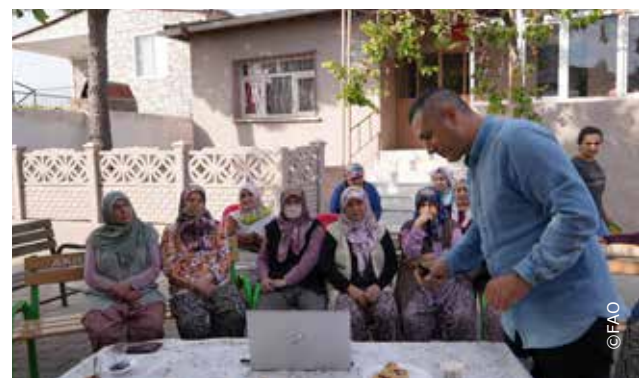
The digital platform uygulamalificitciokulu.org offers farmers access to practical and interactive educational resources.

FAO-Türkiye is dedicated to providing farmers with modern agricultural techniques that increase productivity and ease the transition to sustainable farming. The digital platform plays a key role in preparing farmers for the agricultural challenges of the future. In support of this initiative, comprehensive field visits have been conducted in ten provinces. These visits are critical for acquainting farmers with the platform's features, ensuring they can effectively utilize these digital tools to advance their farming practices.