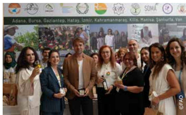
HepYerinden acts as a digital hub for cooperatives, providing a space for collaboration and a unified identity.

Stories of resilience from cooperatives that overcame impacts of the February earthquakes have demonstrated the transformative potential of HepYerinden. The platform is not just a marketplace; it functions as a symbol of collective strength and a tool for sustainable development in Türkiye's agricultural sector.