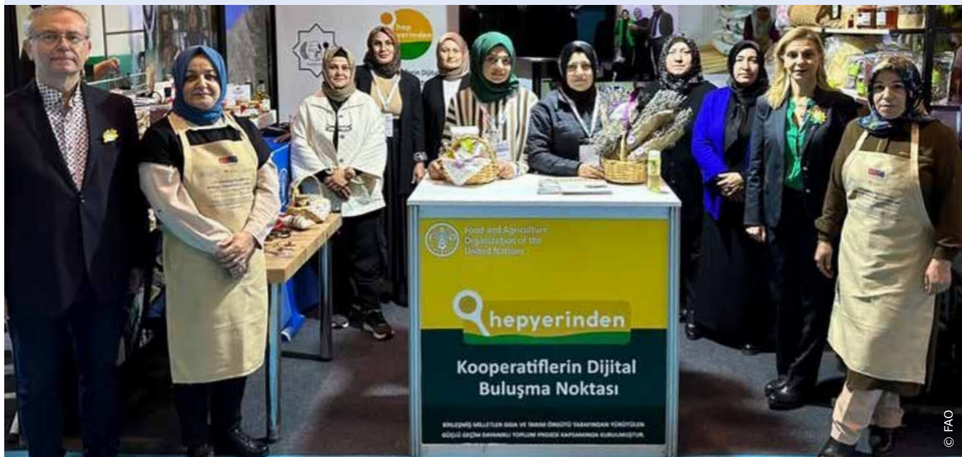
Hepyerinden.koop, an FAO-supported digital marketing network comprising 10 women's cooperatives from across Türkiye, attracted great interest at the 5th Türkiye Cooperatives Fair.