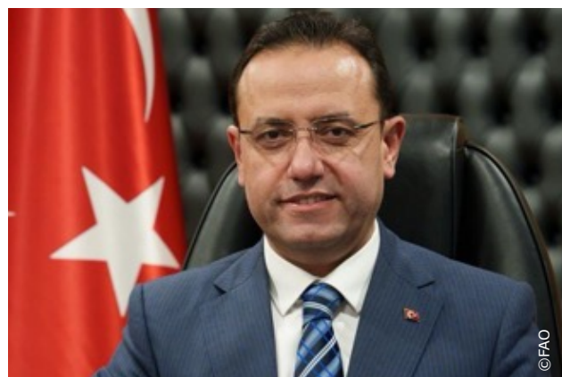
Ebubekir Gizligider, Deputy Minister of the Ministry of Agriculture and Forestry

Climate change, natural disasters and ongoing conflicts in various parts of the world have all demonstrated the importance of safe and accessible food for human health. Unfortunately, a significant portion of the world's population still face food insecurity and malnutrition.