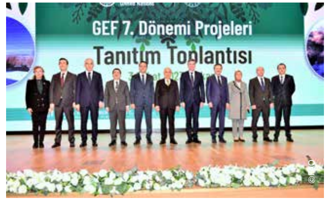
GEF 7 launch event organized in cooperation with MoAF.

The year also saw an increase in the visibility of the FAO Türkiye Partnership Programmes (FTPP) in international fora. A regional workshop dedicated to the FTTP took place on 24 January in Baku, to discuss the results and successes