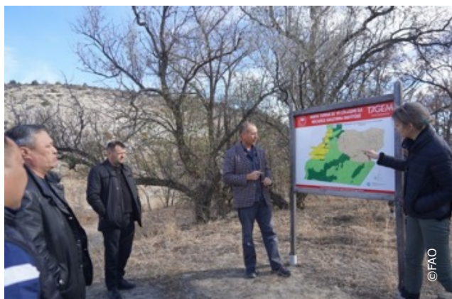
FAO-Türkiye partnership expands to Nigeria's Borno state with crop diversification project for drylands.

The project inception meeting was held online on 6 November 2023, and was attended by high-level officials and relevant experts from Nigeria and Türkiye.