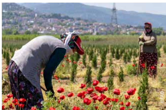
The study's findings indicated that the project achieved its targets.

Data from the report clearly illustrate the project's profound impact on local labour dynamics and the effectiveness of focused efforts to enhance economic and social welfare in the communities it serves. Additionally, the report noted a marked improvement in vocational skills among beneficiaries, particularly in the agricultural sector, signalling a shift towards more sustainable and resilient livelihoods. Overall, the findings demonstrate that the project helped to empower communities and promote agriculture as a viable and fulfilling occupation.