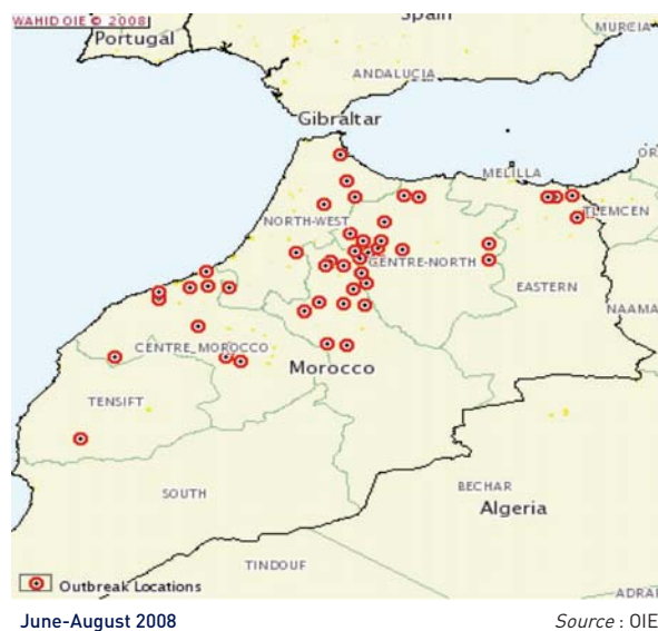
Figure 1. PPR outbreaks in 2008 in Morocco

Retrospectively it is believed that the first outbreak occurred on 12 June 2008 in the rural village of Ain Chkef, Moulay Yacoub, not far from Fès. PPR was confirmed by laboratory tests on 18 July and reported to the World Organization for Animal Health (OIE) on 23 July, 2008. In the aftermath of its initial detection, the disease has spread quickly such that by 4 August, 92 outbreaks had been identified by the Moroccan veterinary services, of which 25 have been reported in the previous five days.