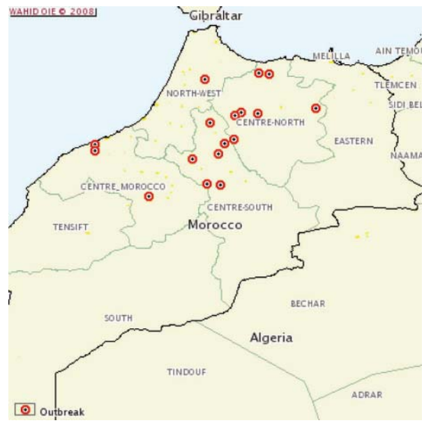
June 30th - July 19th: 24 epidemic field outbreaks in 20 days