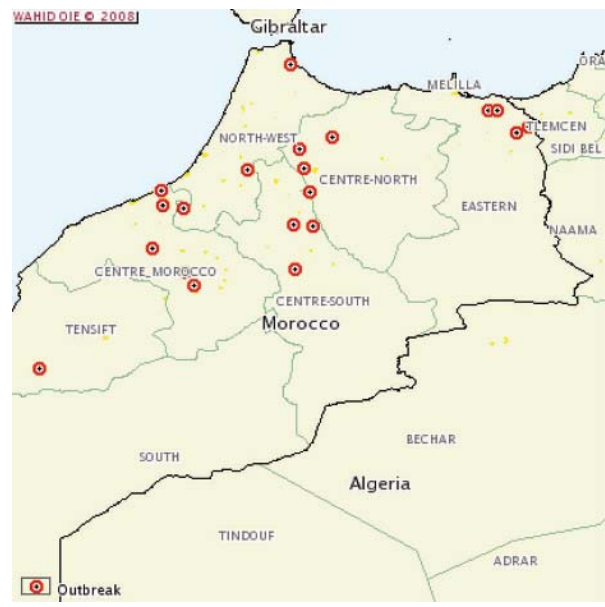
July 31st - August 4th: 25 epidemic field outbreaks in 5 days