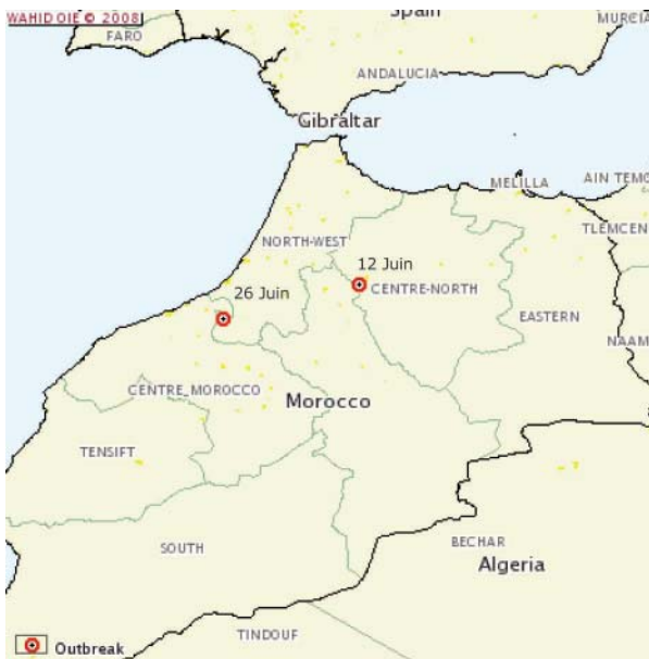
June 12th and June 26th: 2 epidemic field outbreaks reported in 15 days