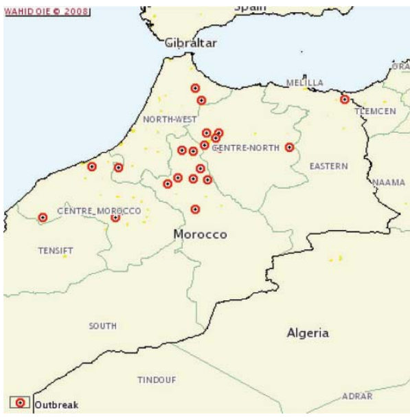
July 20th - July 31st: 41 epidemic field outbreaks in 12 days.