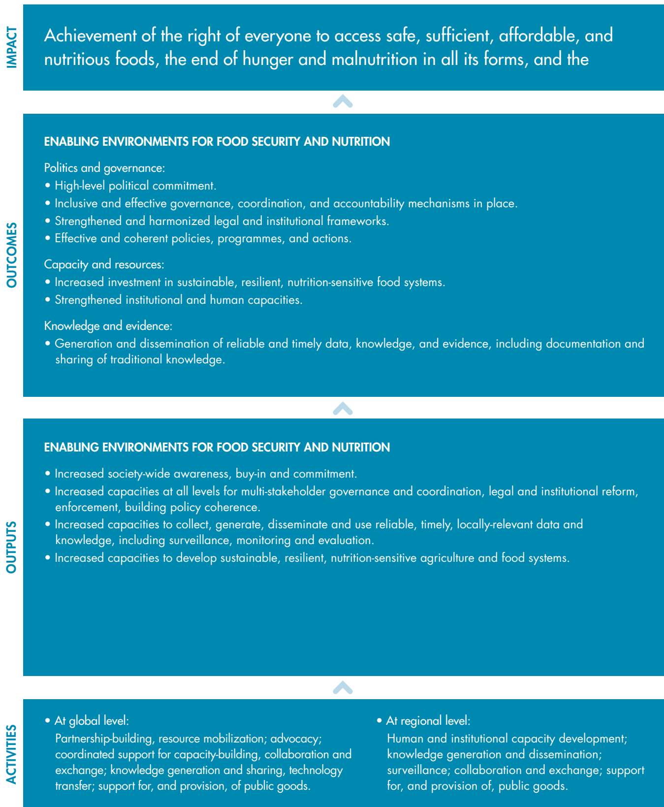
Figure 1: Theory of Change