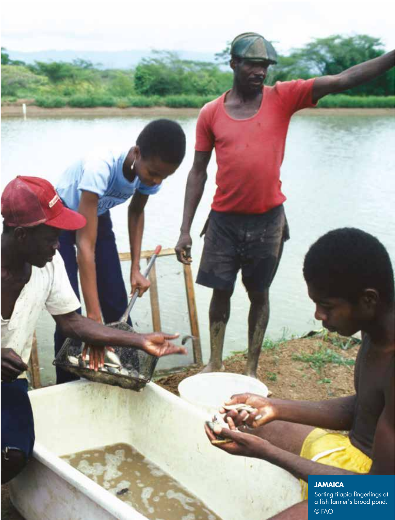
JAMAICA Sorting tilapia fingerlings at a fish farmer's brood pond.