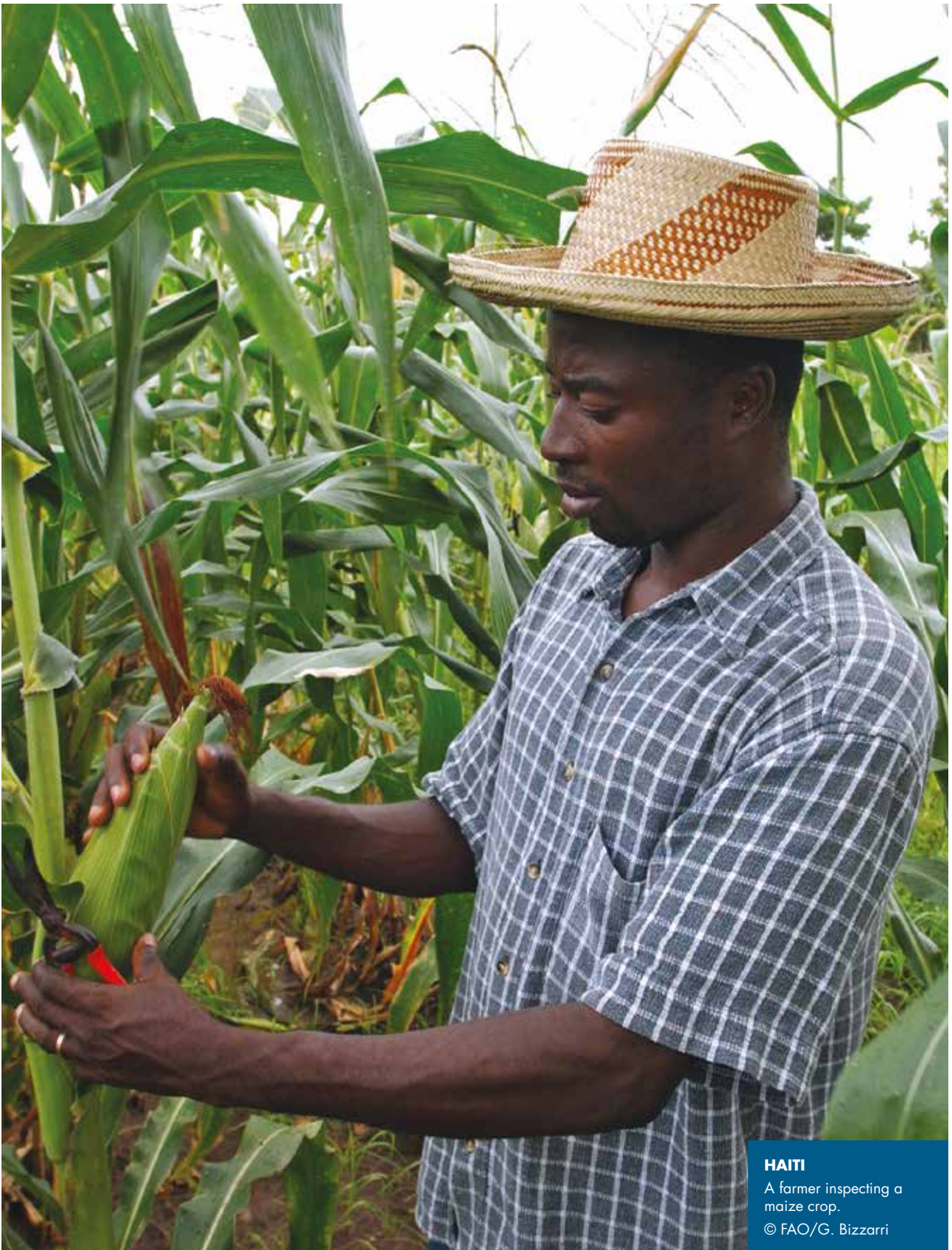
HAITI A farmer inspecting a maize crop.