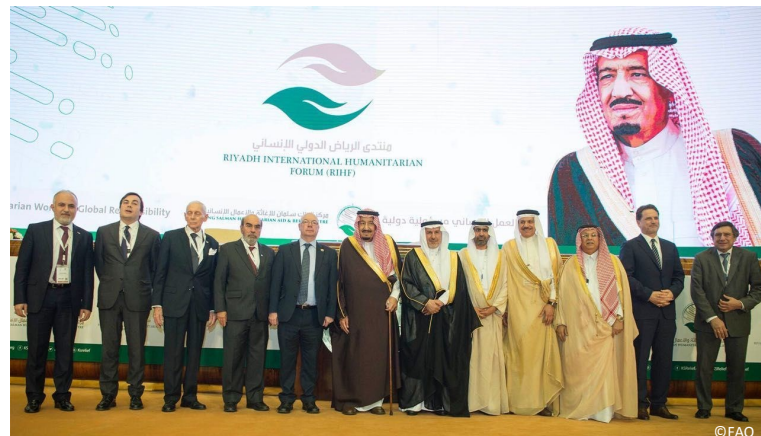
FAO Director-General José Graziano da Silva (fourth from left) at the Riyadh Humanitarian Forum.

While humanitarian funding requirements nearly tripled from USD 8.5 billion in 2013 to USD 22 billion in 2018, agriculture has been one of the least-funded sectors under the UN's 2017 humanitarian appeal. This is despite the growing evidence that investing in agriculture is a fundamental and cost-effective way to respond to crises. Read more