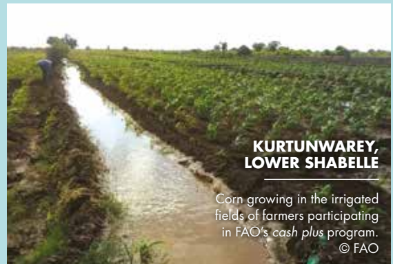
KURTUNWAREY, LOWER SHABELLE

this season's sporadic rains; beneficiaries of our cash plus interventions will see a harvest in July/August. Giving rural families a reason to stay home and plant – and the means to do so – has kept livelihoods intact, helped stave off famine, and is rebooting local food production.