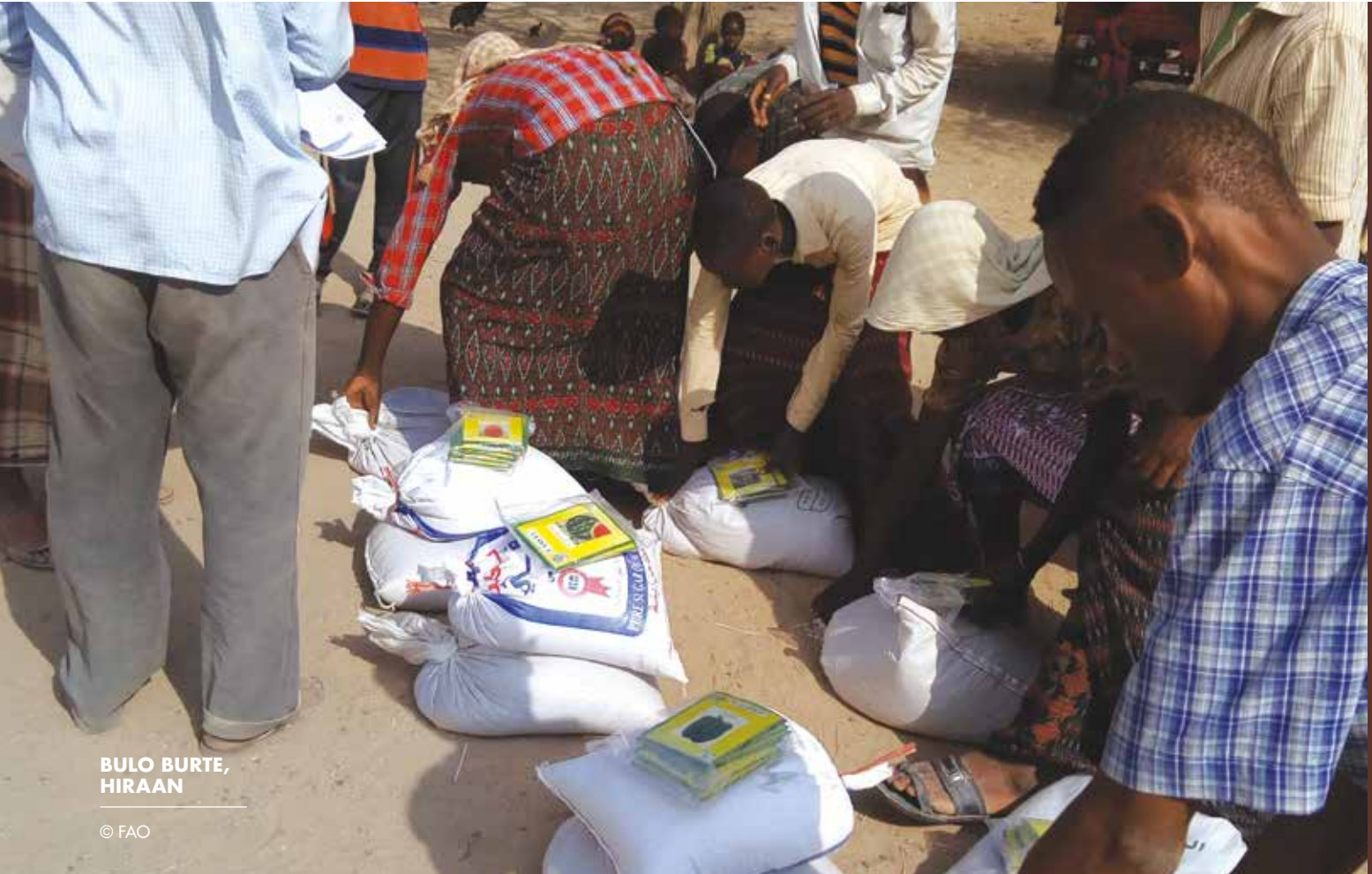
BULO BURTE, HIRAAN

stripped of cash. They had lost their livelihoods once before; they were on the brink of losing everything once again. With cash in their pockets to ease the pressures they face, they stayed home and sowed their fields, keeping their lives intact.