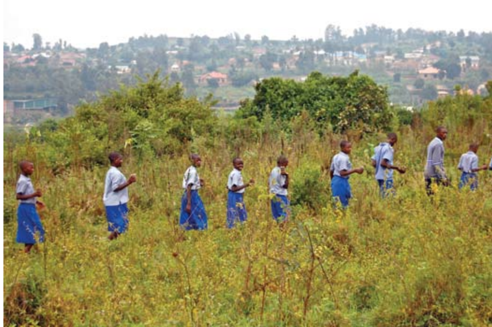
Schoolchildren in Rwanda set out to plant trees on World Environment Day 2010.