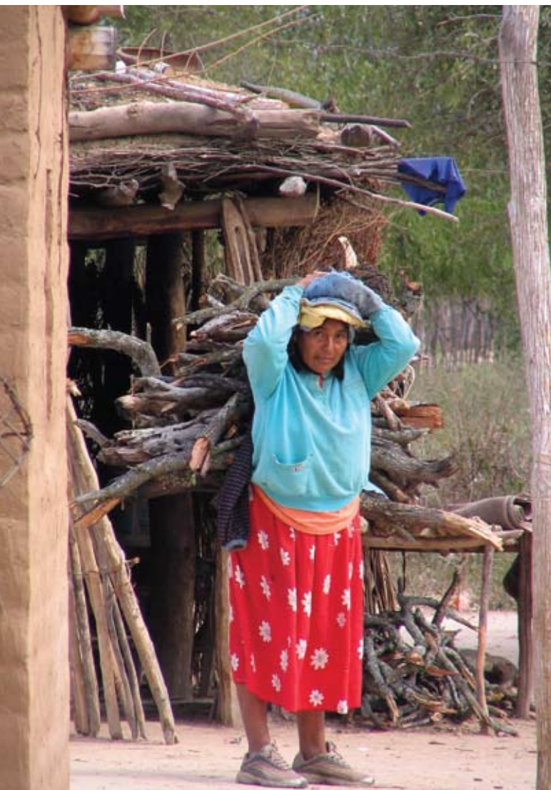
Women play a particularly important role in managing forests because they depend on them for many of their activities. This woman in Argentina, for instance, has to spend much time and effort in collecting fuelwood and carrying the heavy load home. CARE