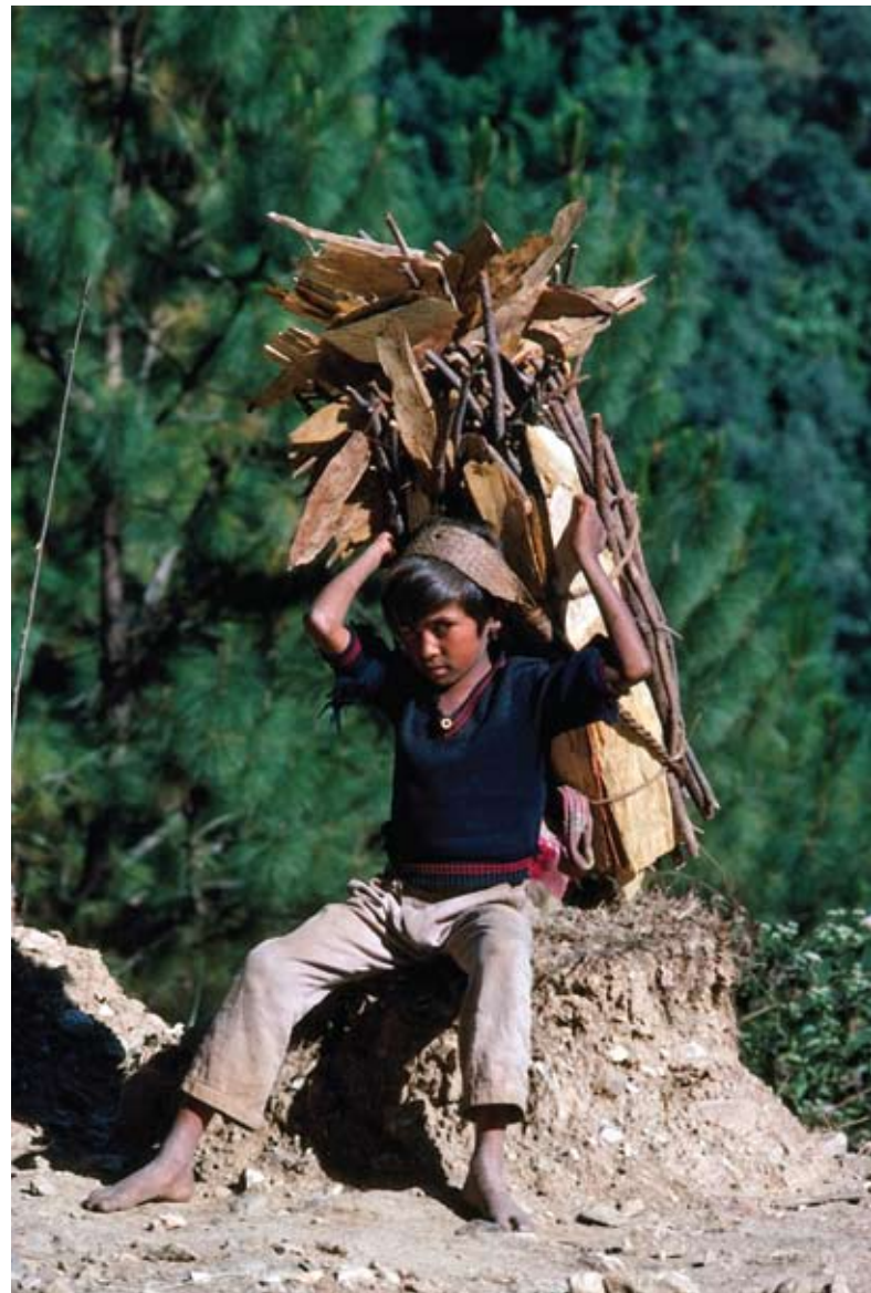
Like children in many countries, this young boy in Assam, India labours hard in carrying fuelwood over long distances.