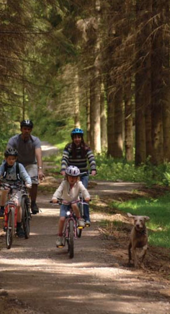
Forests: a rich resource for family recreation: bicycling on a family-friendly forest trail.