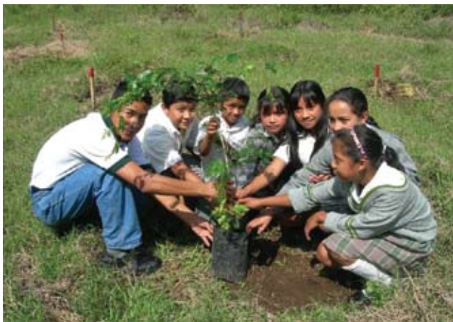
Children plant trees to celebrate Tree Day (el Día del Árbol) at the Escuela Nacional Central de Agricultura, Guatemala.