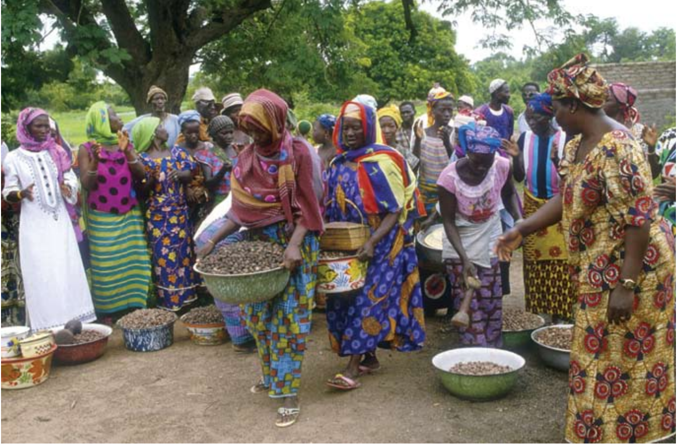
This women's collective in Burkina Faso gathers Butyrospermum paradoxum ssp. parkii nuts for processing into shea butter for sale.