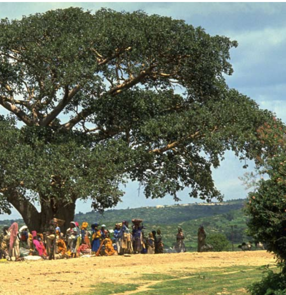
People rest under the shade of a large tree in the Shewa region, Ethiopia.