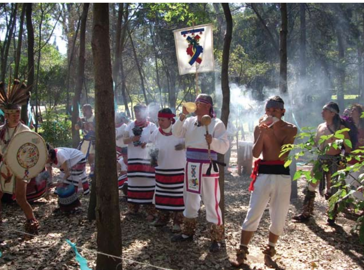
The Parque Nacional Bosque de Pedregal, an urban forest in Mexico City, has its own cultural centre, the Casa de Cultura, which among its activities sponsors workshops for dance and other arts.