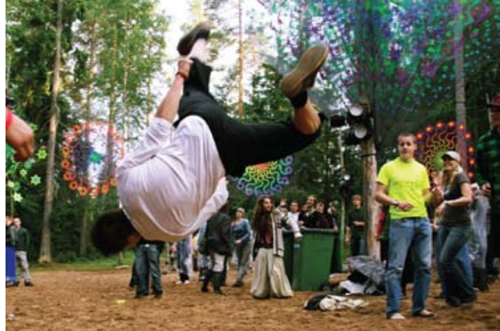
In Finland, the annual open-air forest festival known as "Konemetsä" promotes an alternative lifestyle of peace, love, unity and respect.