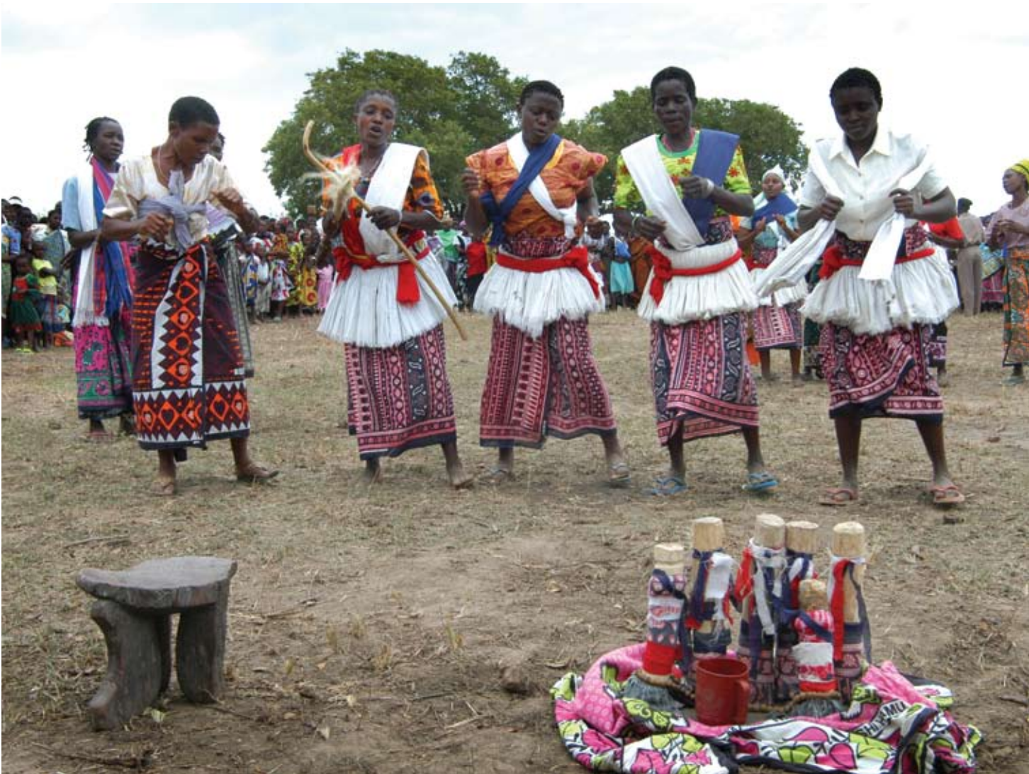
The Mijikenda people of Kenya regard the kaya (meaning "home" or "village") forests as the abodes of their ancestors and revere them as sacred sites – which also contributes to their conservation. In one traditional rite, women dance before memorial grave posts after dressing them with ribbons.