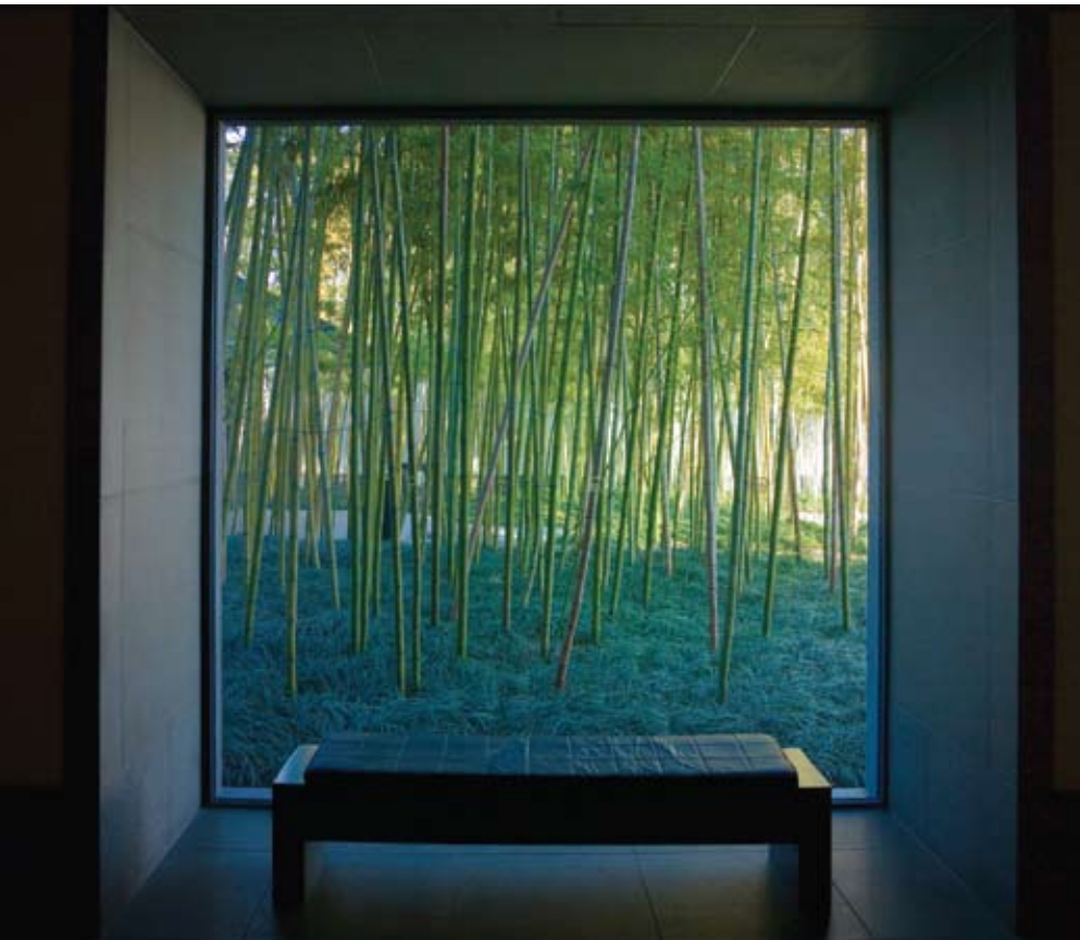
A window at I.M. Pei's modern Suzhou Museum in Suzhou, China, offers a view of bamboo forest for visitors to admire as if it were a painting in its own right.