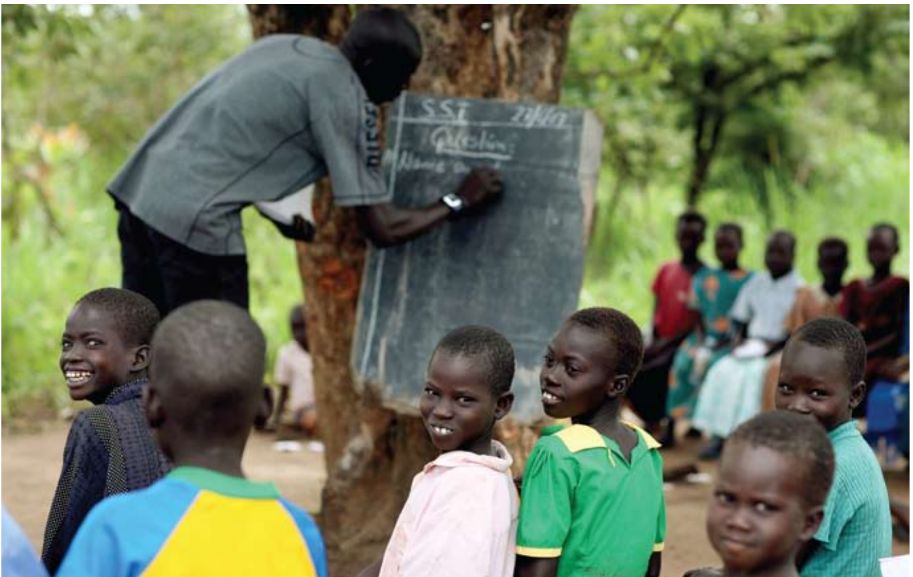
Trees make an outdoor classroom: children attend classes under a tree in a village in Southern Sudan.

A forest ranger in Slovenia teaches schoolchildren about the joys of the forest.