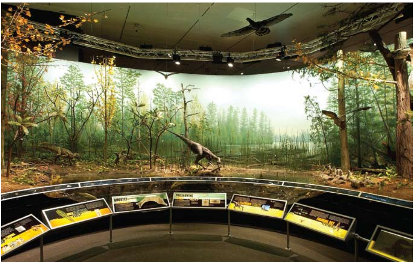
The 65 m 2 Liaoning Forest Diorama at the American Museum of Natural History in New York is a detailed recreation of how the Jehol Forest in China looked 130 million years ago. It depicts the rich biodiversity of the Mesozoic forest, with life-size models of more than 35 different species of dinosaurs, reptiles, early birds, insects and plants.