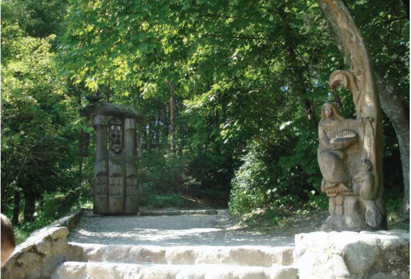
The Hill of Witches near Juodkrantė, Lithuania, is an outdoor sculpture gallery on a forested sand dune. Begun in 1979, it now contains about 80 wooden sculptures along a series of trails. The artists drew on a long tradition of woodcarving in the region, and on the equally long tradition of Midsummer Night's Eve celebrations on the hill. The statues depict characters from Lithuanian folklore and pagan traditions.