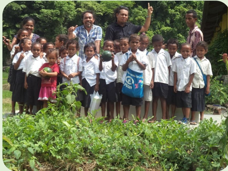
Figure 5. Teacher and students at the school garden

— Message from Eugenio ‘Ego’ Lemos, Permaculture Timor-Leste (Permatil)