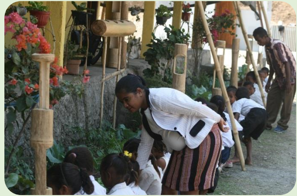
Figure 2. Teachers helping the students in the school garden

Many young people get involved in the Permaculture/Agroecology system in Timor-Leste and every two years Permatil organizes a Permaculture Youth camp in which around one thousand young people participate.