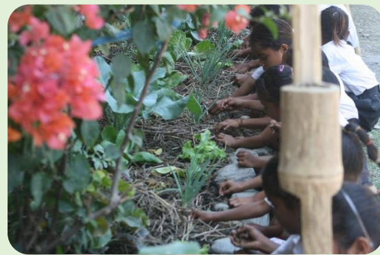
Figure 1. Students working in the garden during school garden classes

In 2013, the Ministry of Education of Timor-Leste decided to reform its national curriculum for Basic Education from grade one to six. Permaculture/Agroecology school gardens had been part of the discipline of Arts and Culture. The organization behind this movement of Permaculture/Agroecology is Permatil (Permaculture Timor-Leste), which was established in 2002. This school garden program now became part of formal education of Timor-Leste. 1415 schools have been targeted to introduce school gardens across the territory of Timor-Leste. The main reason for introducing school gardens is to help teachers and students learn how to grow a variety of seasonal food crops that can contribute to the school feeding program, shifting from passive learning inside classrooms into activities outside the classroom, while providing beauty to the school landscaping. School students and communities learn how to copy the model into their home garden to improve health and nutrition of the wider family.