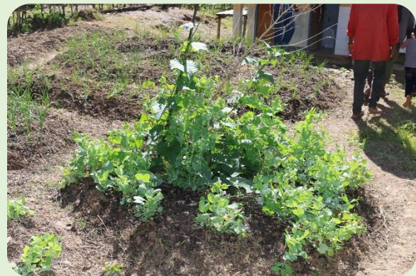
Figure 3. Productive school garden

The future cost for food will be reduced and the system will benefit the local people as every input is produced locally and there is no need to buy external inputs. Every school will decide the menu for the school feeding program without depending all the time on the Ministry of Education or companies to supply food.