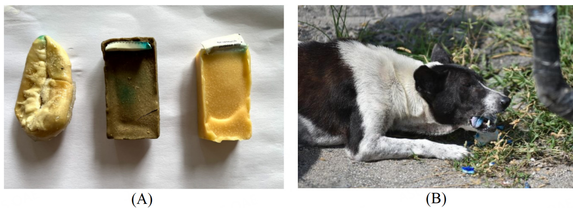
Figure 2. (A) Different baits used (left: boiled intestine; middle: fishmeal; right: egg-flavored); (B) the appearance of blue coloration of the oral cavity and tongue.

determining which bait type would be offered to the dog encountered (according to the randomization list), for filling out the animal registration and treatment record form as well as informing dog owners or other persons present on the purpose of the study, and also answering any other questions raised by the bystanders. A leaflet was available for interested bystanders, including a phone number that the public could