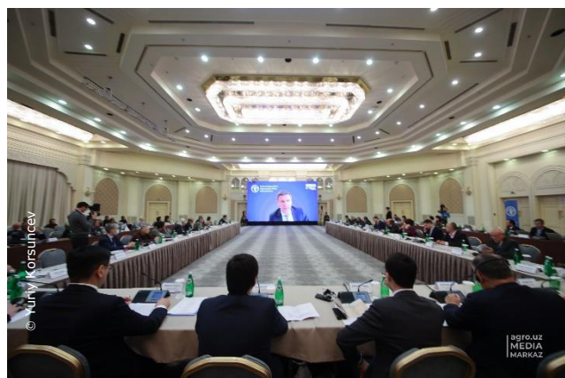
Opening ceremony of the International Conference on Cold Winter Deserts

Bringing together the researchers, academia, scientific institutions as well as stakeholders, students from local and international universities, representatives of international organizations, the conference was set to become a platform for discussing options for the development and conservation of the temperate desert territories, as well as to raise awareness of advanced technologies for sustainable land management, disseminating knowledge about biodiversity conservation in ecosystems of temperate desert zones.