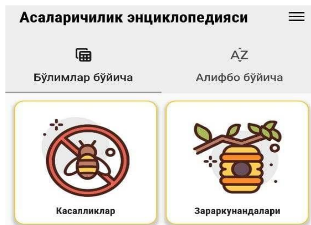
The mobile application interface

The workshops were held not only in Tashkent, but also in Fergana and Samarkand. The workshops addressed such issues as intensive technologies in the use of bee arbors, organization of an accounting system that reflects the effectiveness of beekeeping, technologies for the industrial cultivation of queen bees, the procedure for exporting honey and the requirements of foreign countries for the quality of honey, the procedure for treating bees and using medicines, new technologies in the world beekeeping.