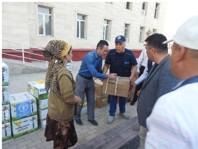
Handing over process in Bukhara region

FAO Representation in Uzbekistan handed over 20 motor cultivators, 30 water pumps, 20 knapsack sprayers and 10 pit drills to the rural households of pilot regions.