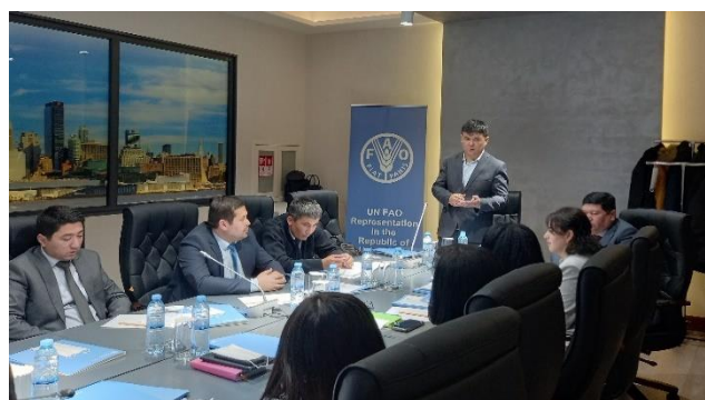
Participants of the workshop discussing implementation of FIES

During the workshops specialists presented detailed analysis of the results of sample surveys conducted using the FIES module in the households in Uzbekistan for July-December 2021.