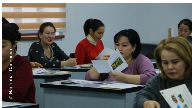
Participants of training on horticulture in Bozatau district of Karakalpakstan

FAO conducted a series of trainings to strengthen agricultural capacities of the rural population of Karakalpakstan. The trainings were organized as part of a Joint Programme implemented by United Nations Development Program (UNDP), the United Nations Population Fund (UNFPA) and FAO aimed at strengthening adaptive capacity of vulnerable citizens of the Aral Sea region to address the difficulties of economic and food insecurity. The Joint Programme is funded by the UN Multi-Partner Human Security Trust Fund for the Aral Sea Region in Uzbekistan.