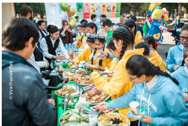
Students of specialized school No.102 for children with difficulty of hearing celebrate the World Food Day

“Environmental education is an important factor for ensuring sustainable development and increasing everyone’s responsibility in the rational use of natural resources. Ultimately it forms the environmental awareness of the society. At the same time, nutrition education from an early age allows to make a choice in favor of healthy food in the pathway to strengthening the population’s health, eradicating hunger and improving food security. In this regard, the implementation of this project is very important and fully complies with the Sustainable Development Goals”, — Sherzod Umarov, Assistant FAO Representative in Uzbekistan stressed.