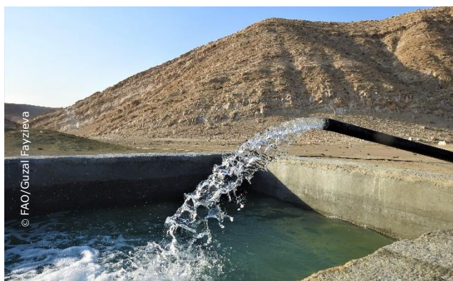
The well rebuilding initiative resolved the issue of water-shortage for livestock in the village of Takham, Kashkadarya region

Placing drinking wells for livestock evenly throughout the area is important to avoid the overuse of pastures. However, as many wells in desert and semi-desert pastures become unusable over time, their restoration is a rather difficult and costly process for shepherds. The FAO/GEF regional project CACILM-2 aided the renovation of a well located near the village of Takham, Guzar district, Kashkadarya region, which in turn provided a great support for local livestock breeders.