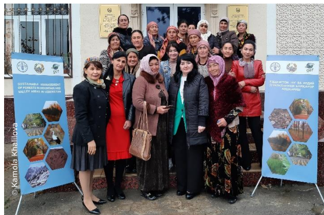
Participants of the workshop in the Kitab State Forest Organization

When implementing the FAO/GEF project “Sustainable Forest Management in Mountainous and Valley Regions of Uzbekistan”, special attention is given to mainstreaming gender into forest management. In this regard, in October-November 2021, a series of workshops were held for workers of the Syrdarya, Dekhkanabad, Kitab and Pop state forest organizations. The workshops were held to present the Gender Equality Strategy of the State Forestry Committee of the Republic of Uzbekistan for 2021-2025. The events also elaborated on gender council workplans established in each forestry organization.