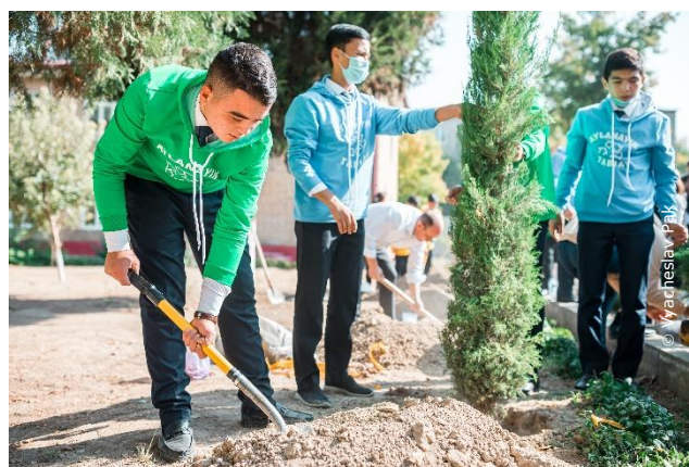
Children learn the rational use of the soil in practice

of Presidential Educational Institutions. Project participants have the opportunity to gain practical skills on biodiversity and proper nutrition.