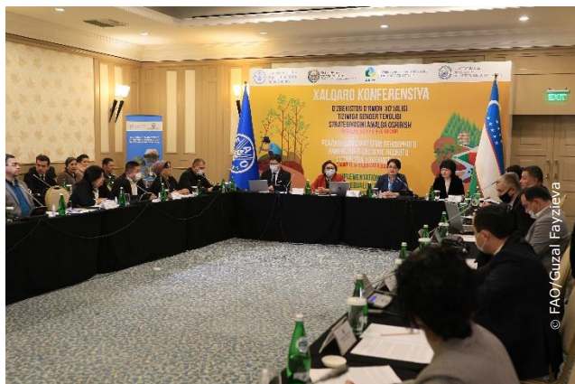
Opening ceremony of the International Conference

FAO together with the State Forestry Committee of the Republic of Uzbekistan organized an international conference on “Implementation of the Strategy for Gender Equality in the Forestry System of Uzbekistan”.