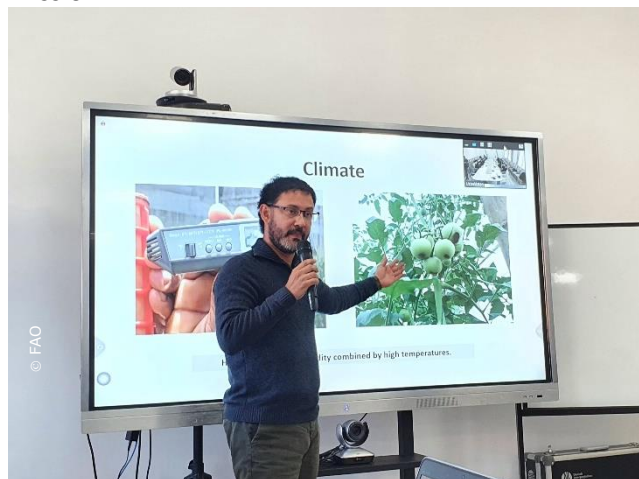
Training at the National Center for Knowledge and Innovation in Agriculture (AKIS) in Tashkent region