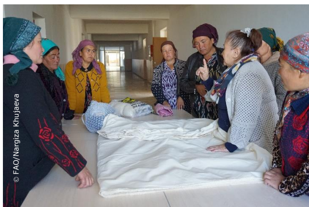
Training participants in Navoi region