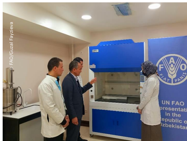
Students evaluate the possibilities of new laboratory equipment