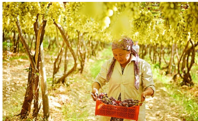
Grapes from the Altyaryk district of the Ferghana region as an example of using geographical indications in Uzbekistan

The Inception Workshop was held within the framework of the project “Strengthening sustainable food systems through geographical indications” that is implemented by FAO and the Ministry of Agriculture of Uzbekistan. At the event national and international experts presented the goals and objectives of the project, including introduction of GIS practices for the selected products through awareness raising campaigns and capacity building measures, developing and implementing an effective GI marketing strategy, etc.