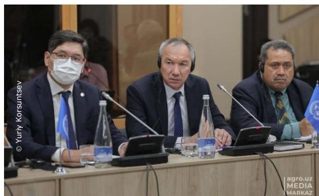
FAO experts provide information on the objectives of the project “Rice Crop Production and Management Support”