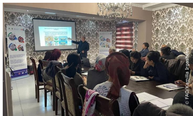
Training on conservation agriculture in Bozatau district of Karakalpakstan

In addition to the Bozatau district, the project areas include the Muynak and Kungrad districts of Karakalpakstan, where trainings are provided on the topics mentioned, as well as on livestock development and water-saving technologies. Within the framework of the Joint Programme technical support will be provided to one fish farm in each of three districts for upgrading existing fishery ponds.