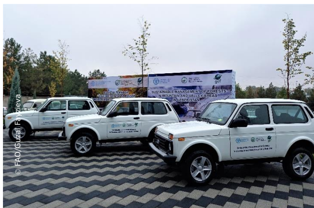
NIVA off-road vehicles purchased by FAO for state forest organizations

FAO handed over special NIVA off-road vehicles to the Pop, Dehkanabad and Kitab forestry organizations within the framework of the project “Sustainable Forest Management in Mountain and Valley Areas of Uzbekistan”. Special off-road vehicles were purchased by FAO to solve the issue of transportation in hard-to-reach mountain regions when performing the tasks of the project.