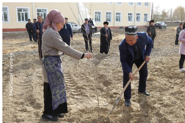
Workers of Kitab State Forest Organization participate in FAO Tree Planting Campaign