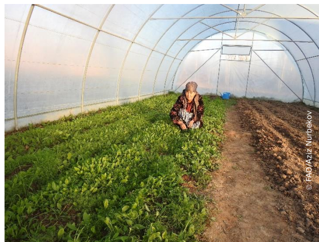
CACILM-2 project beneficiary working in a greenhouse. Kamashi district of Kashkadarya region, "Loykasoy" mahalla

A greenhouse opens up great income-generating opportunities for vulnerable households to improve their livelihoods throughout the year. Producing certain crops during early spring and late autumn, greenhouse owners will be able to meet the demand of the local community for fresh vegetables and greenery in low agricultural season thereby getting a stable source of income.