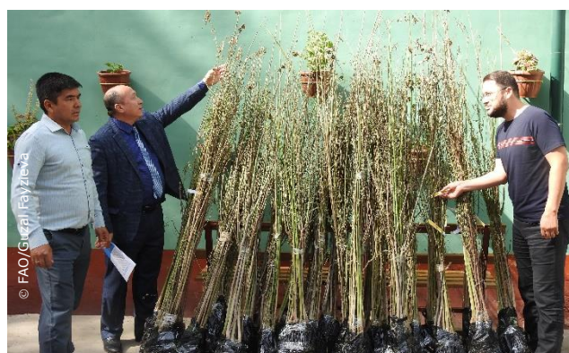
Seedlings for distribution in the Pop State Forest Organization

In 2021 the project initiated forest plantations were created in total area of 1220 hectares and more than 265 thousand seedlings four pilot plots.