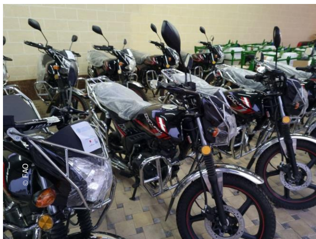
Equipment granted by FAO to the Agency of Plant Protection and Quarantine of the Republic of Uzbekistan

An improved response mechanism to locust outbreaks is being introduced by FAO through the project, using less harmful pesticides and biological pest control products.