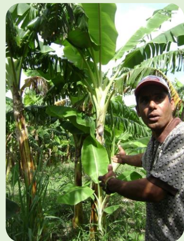
Figure 1. Farmer demonstrates intercropping of plantains with annual crops.

At the same time, important changes were put in place with respect to land tenure and the organization of farmer cooperatives. By the end of this period, though Cuba was surviving, ANAP still saw the need for to go farther into agroecological farming with greater diversification and integration of ecological practices. However, it was clear that widespread transformation would be impossible without a methodology to build a social process to accelerate adoption of agroecology. Though agroecological techniques abounded, Cuba needed to develop a process by which to better disseminate them and foment their adoption among the nation's farm families. Thus, during the Special Period, the stage was set for the arrival of the Campesino to Campesino method (CAC) from Central America to Cuba.