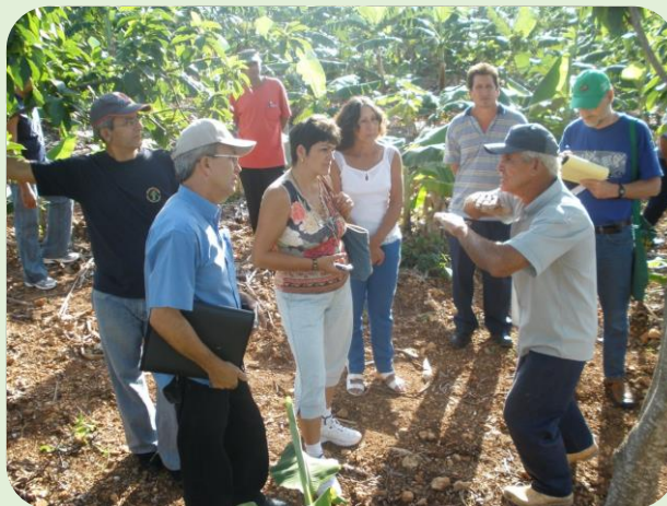
Figure 3. Farmers explains his mixed cropping system in campesino to campesino exchange visit

Due to Cuba's geography, it is susceptible to declines in agricultural production as a result of constant natural disasters. Therefore, resilience is a particularly important factor for the island. Cuban farmers have already witnessed the benefits of agroecology in the face of hurricanes: farms with a greater level of agroecological integration have suffered less in the face of such phenomena. This may be partially explained by the fact that agroecological systems suffer less from erosion and landslides due to greater implementation of soil conservation practices (contour planting, gully control, greater use of cover crops, etc.). Fewer crops are lost when multiple strata of vegetation exist.