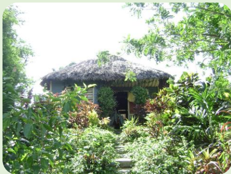
Figure 4. The home of a peasant family that farms agroecologically.

In sum, through MACAC's farmer families, agroecology offers Cuba a more efficient way to produce its food than conventional monocrop agriculture – per unit of land area as well as per worker. Furthermore, it does not depend on imported inputs, which are costly and toxic to people and the environment. Finally, agroecology better resists droughts and hurricanes, not to mention other internal and external factors which should be taken into account, such as depletion of natural resources, particularly soil degradation, which affects 70% of Cuba's agricultural land. While conventional agriculture further contributes to land deterioration –threatening future food sovereignty of the