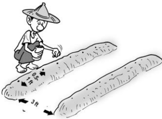
Sowing seeds on raised beds