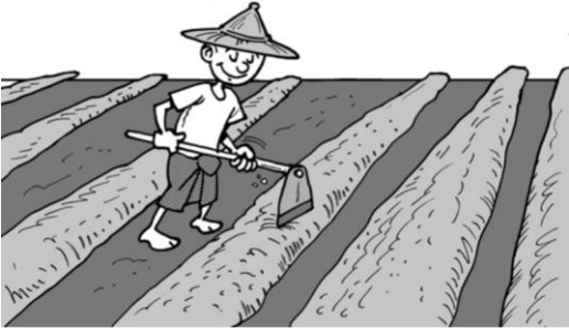
Sowing seeds on raised beds