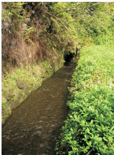
Singapore daisy choking waterways

The plant has a very wide ecological tolerance. It can thrive well in open areas with well-drained, moist soil, but can also tolerate dry periods. The plant is found to grow up to 700 m or more in elevation (up to 1,300 m in French Polynesia). It is a noxious weed in agricultural areas, coastlands, natural forests, planted forests, ranges/grasslands, riparian zones, scrub/shrub lands, urban areas, waste places and garbage dumps and other disturbed sites. The weed is also found along streams, canals, at the borders of mangroves and in coastal strand vegetation.