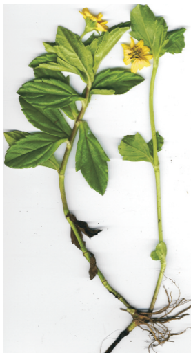
Singapore daisy - twig with flowers

Singapore daisy is a creeping, mat-forming perennial herb which grows up to 70 cm in height. The stems are prostrate, rounded, rooting at the nodes, 1 - 3 (-4) m long. The flowering portions are ascending, coarsely strigose to spreading hirsute, and sometimes sub-glabrous. Leaves are dark green, fleshy, entire, usually 4 - 9 cm long, (1.5-) 2 - 5 cm wide,