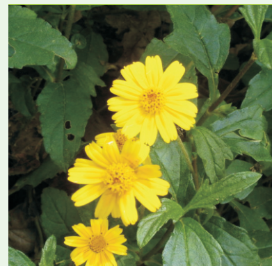
Singapore daisy - Habit

The Asia-Pacific Forest Invasive Species Network (APFISN) has been established as a response to the immense costs and dangers posed by invasive species to the sustainable management of forests in the Asia-Pacific region. APFISN is a cooperative alliance of the 33 member countries in the Asia-Pacific Forestry Commission (APFC) - a statutory body of the Food and Agriculture Organization of the United Nations (FAO). The network focuses on inter-country cooperation that helps to detect, prevent, monitor, eradicate and/or control forest invasive species in the Asia-Pacific region. Specific objectives of the network are: 1) raise awareness of invasive species throughout the Asia-Pacific region; 2) define and develop organizational structures; 3) build capacity within member countries and 4) develop and share databases and information.