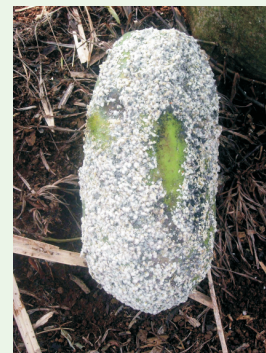
Papaya fruit infected with mealy bug