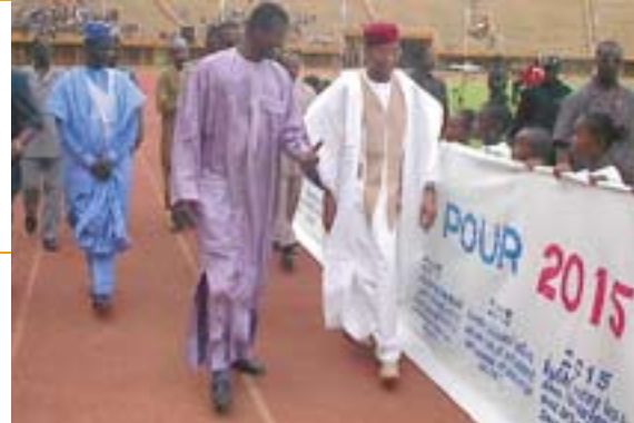
From right to left: the President of the Republic of Niger, Ali Abdoulaye (ROSEN/ONG-VIE), the Minister of Basic Education of Niger

system for early retirement. With premature departures of teachers, whose experience underpins the fundamental quality of teaching and training, how can we hope to achieve quality education?