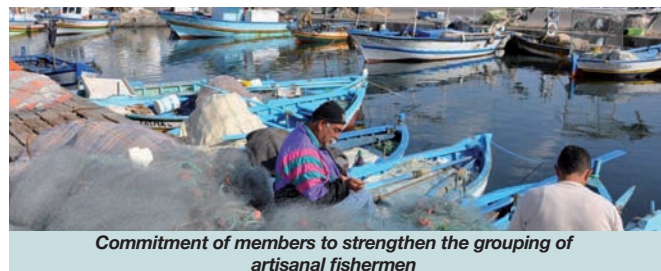
Commitment of members to strengthen the grouping of artisanal fishermen

A meeting was organized on 14 October 2014 by the FAO Regional Office for North Africa, the Directorate General of Fisheries and Aquaculture, the Interprofessional Association of Fishery Products and the Tunisian Association for the development of Artisanal Fisheries, with the participation of the WWF/ Mediterranean Programme Regional Office for North Africa, the Tunisian Union of Agriculture and Fisheries (UTAP) and the Agricultural Investments Promotion Agency (APIA). The meeting approved the membership of the representatives of organizations of artisanal fisheries, civil society and artisanal fishermen of Tunisian Sahel governorates (Sousse, Monastir, Mahdia) into the Tunisian network of sustainable artisanal fisheries. Since its inception, the Tunisian Association for the Development of Artisanal Fisheries has aimed to play a significant role in regional and international forums and contribute to the global efforts of preservation and development of marine resources. The members of this network are formally committed to supporting the creation of associations and gatherings for the development of artisanal fishing, and preserving the heritage and wealth of the Tunisian coastline. They also aim to create a branch network of organizations of artisanal fishermen on the east coast of Tunisia (Sahel) and contribute to the implementation of voluntary international guidelines to ensure the sustainability of artisanal fisheries