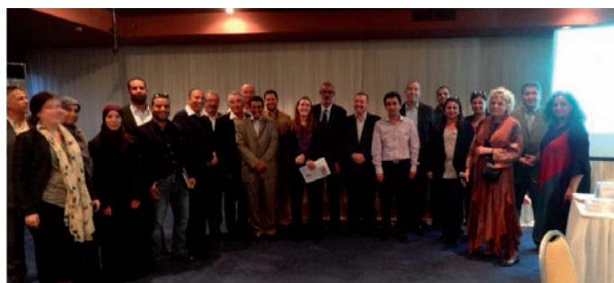
A growing interest in establishing a sub-regional network on the cost of production which is considered as a priority to improve statistical databases of the Maghreb countries

Within the Global Strategy for Improving Agricultural and Rural Statistics, and in line with recommendations provided in the FAO manual on production costs, a workshop was organized by the FAO Sub-regional Office on 13 and 14 November 2014 in Tunis on «improving the collection and analysis of costs of production of agricultural products in North Africa.» The meeting brought together researchers and officials from the extended sub-region to the north shore of the Mediterranean, along with representatives of the FAO. This workshop aimed to define a methodology in line with the needs and resources of North African countries and set up a sub-regional platform for exchanging data on production costs. The proceedings insisted on the need to coordinate the current endeavour both at the national and sub-regional level. The workshop resulted in the creation of a work group tasked with developing an action plan that aims to devise a sub-regional pilot project based on testing different methodologies and establishing farms monitoring centers