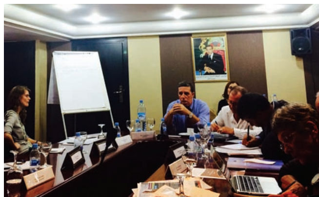
Participation in the work of the sub-regional workshop

A sub-regional workshop on «Agricultural land in North Africa: Situation, problems and prospects» was held in Rabat, Morocco from 19 to 21 November 2014. It was attended by 25 participants from Algeria, Morocco, Mauritania and Tunisia, who belonged to the departments of Agricultural Legal Affairs, departments responsible for agricultural land, forest departments, the research sector and voluntary associations. The participants presented and discussed the results of consultations on agricultural land in Algeria, Morocco and Tunisia. The situation of the agricultural land in Mauritania was also the subject of a presentation. Other sessions were devoted to more advanced topics on land, such as fragmentation and consolidation of agricultural land, land legislation in North Africa, collective land tenure systems and gender equality in access to and control of lands. The representatives of the FAO Economic and Social Department presented the Voluntary Guidelines on Responsible Governance of the Tenure of Land, Fisheries and Forests, as well as the evaluation of legislation for equitable land tenure between sexes, and an overview on the situation of rural women in North Africa. They also shared the results of a sub-regional pilot project for the development of gender-sensitive indicators and their potential inclusion in the AQUASTAT database.