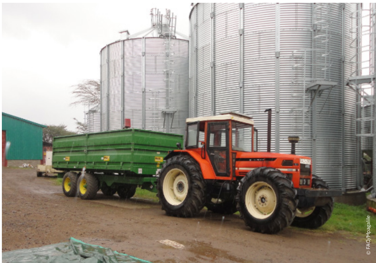
Figure 2: Scenes from a visit at Lengatia farm