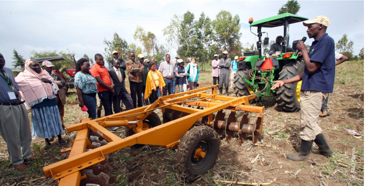
Figure 3: Mechanization activities at Kendat-Agrimech