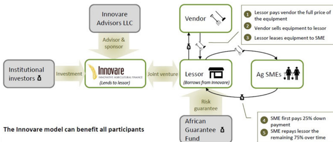
Figure 2 How the leasing facility works