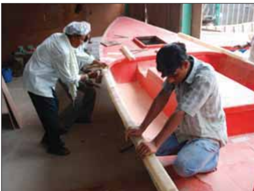
Figure 125 The sheer rail is bonded with a former to take a PVC pipe fender.