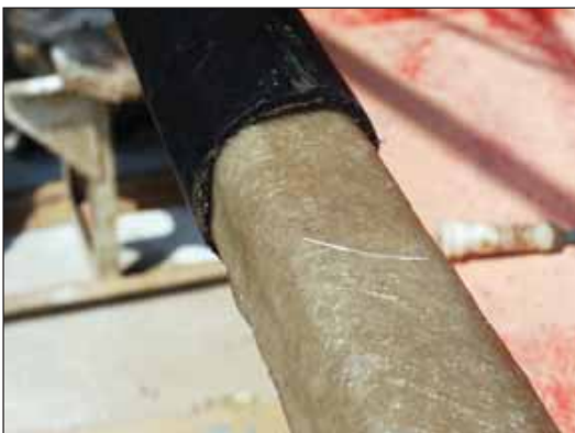
Figure 126 PVC pipe fender.