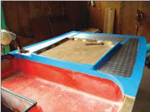
Figure 117 The engine hatch coaming on the aft deck plug.