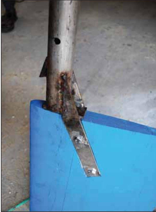
Figure 120 Detail of the rudder for the BOB-drive.