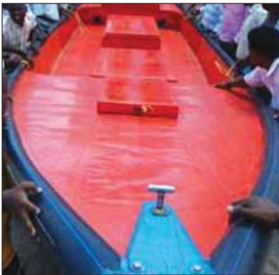
Figure 129 The deck layout of the finished boat.