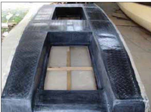
Figure 108 Cockpit deck mould complete.