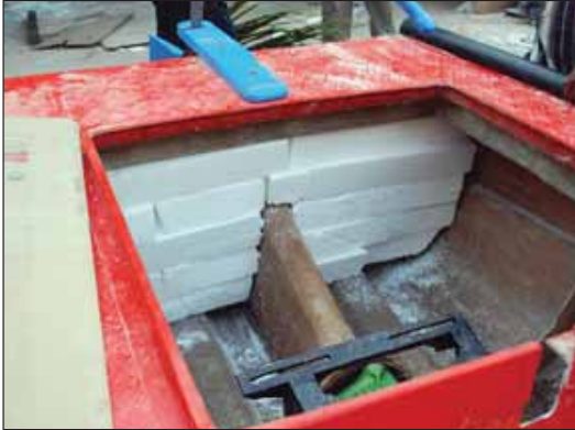
Figure 123 Polystyrene buoyancy blocks under the aft deck.