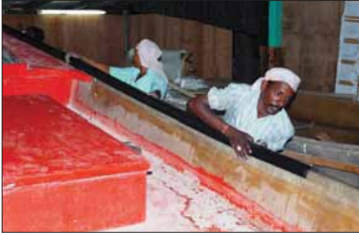
Figure 127 PVC pipe fender being put in place