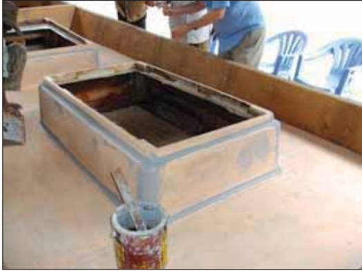
Figure 105 Application of modelling clay.