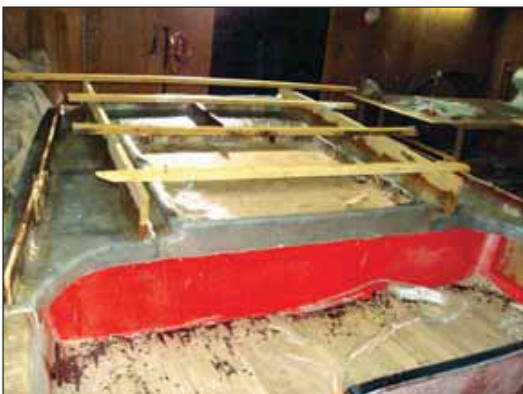
Figure 119 Final stage of the making of the mould for the aft deck.