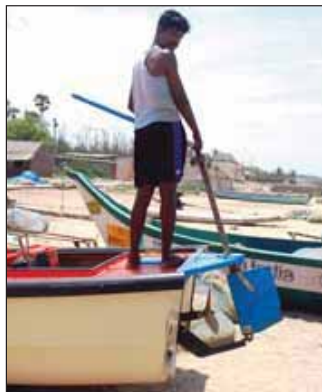
Figure 130 The BoB-drive in a lower position to the left and in a upper position to the right.