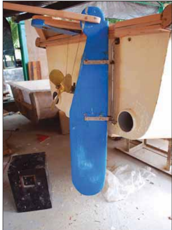
Figure 121 Detail of the emergency rudder to be used with sail.