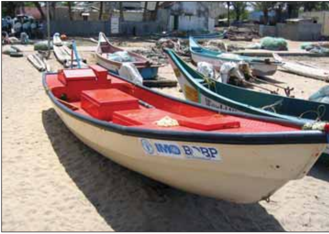
Figure 128 The finished boat.