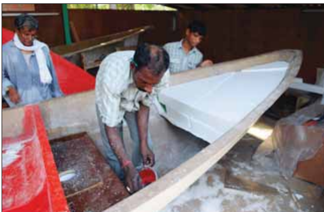
Figure 122 The fore and aft decks are assembled the same way by seating the decks on the hull flange after placing the required polystyrene buoyancy blocks under the deck.

Wooden blocks may be laminated to the hull or deck to fix the strapping for securing the buoyancy in place. Strap the buoyancy blocks in securely. Sealing these foam blocks by painting them with water-based paint or bagging them in plastic will make them more effective and stop them from getting mouldy.