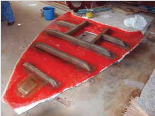
Figure 124 The deck is stiffened with top-hat stiffeners and doubling pads moulded in to take deck fittings.