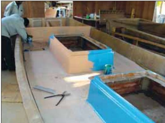
Figure 106 Topcoat being applied.