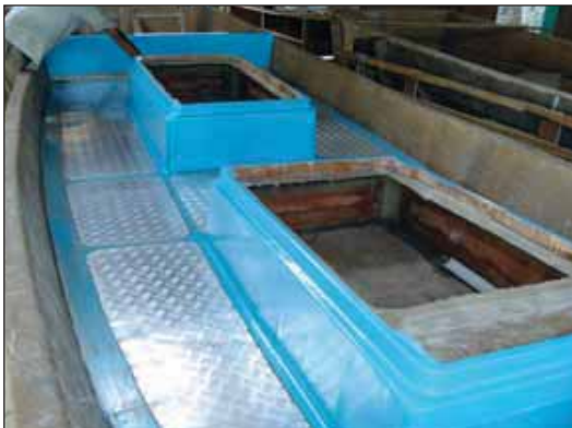
Figure 107 Note the metal plates on the deck to prevent a slippery surface.