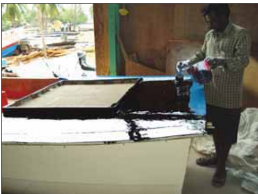
Figure 118 The first layer of gelcoat being applied on the deck plug.