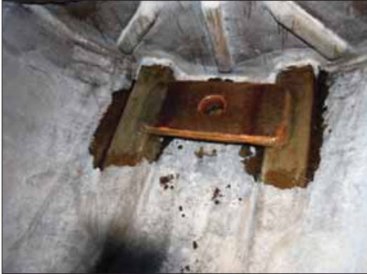
Figure 116 The mast step.