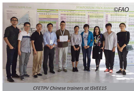
CFETPV Chinese trainers at ISVEE15

FAO China Emergency Center for Transboundary Animal Diseases (ECTAD) Office organized the Chinese trainers of China Field Epidemiology Training Program for Veterinarians (CFETPV) to participate in the 15 th International Symposium of Veterinary Epidemiology and Economics (ISVEE 15) in Chiang Mai, Thailand from 12-16 November 2018. ISVEE 15 was a global forum for interdisciplinary collaboration and communication among graduate students, postdoctoral fellows, practitioners, junior and senior researchers, as well as policymakers, health, veterinary public health, social science, and animal health economic professionals, for learning and sharing with a vision of building a better life tomorrow for veterinary epidemiology at the local, regional, and international levels. The ISVEE15 was organized by the Thai Veterinary Medical Association under Royal Patronage and the Department of Livestock Development, Thailand. 715 participants from 70 countries attended the event.