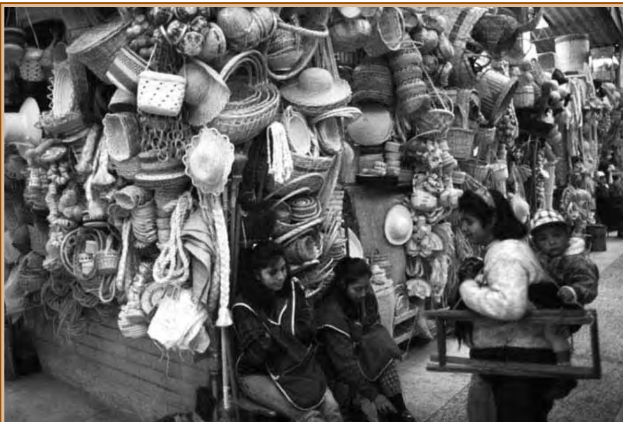
FIGURE 1 Bamboo baskets, mats and plaited products are sold in local markets

mats and other items in Latin America, Africa and Asia (see Box 4).