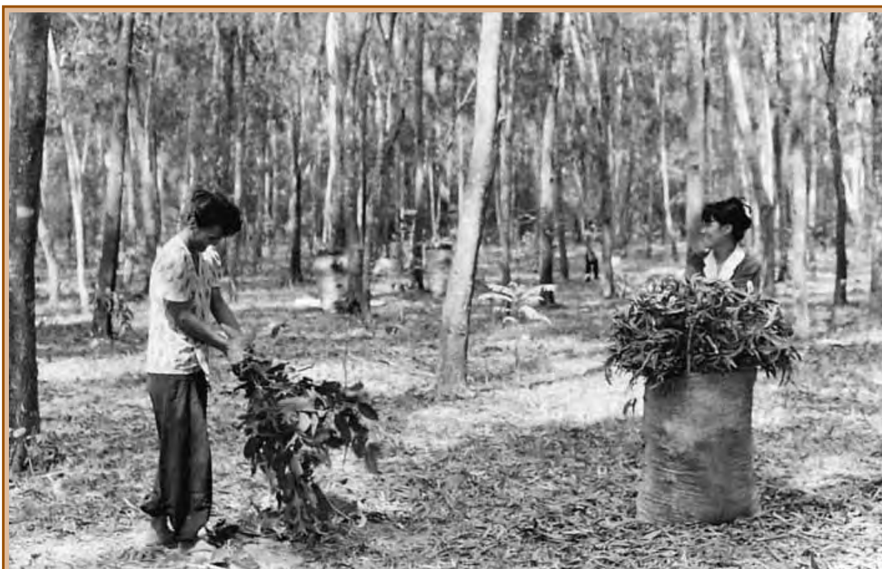
FIGURE 5 Vietnamese women collecting litter (dried leaves, branches and twigs) of Acacia auriculiformis from a forest plantation for domestic use as fuel

NWFP livelihoods are built upon, or powered by, the natural resource base from which products are harvested. This range of plant and animal biodiversity is often freely available and accessible to those living in even the most marginal of conditions. These natural assets are therefore important for people who need to restore their livelihoods or create