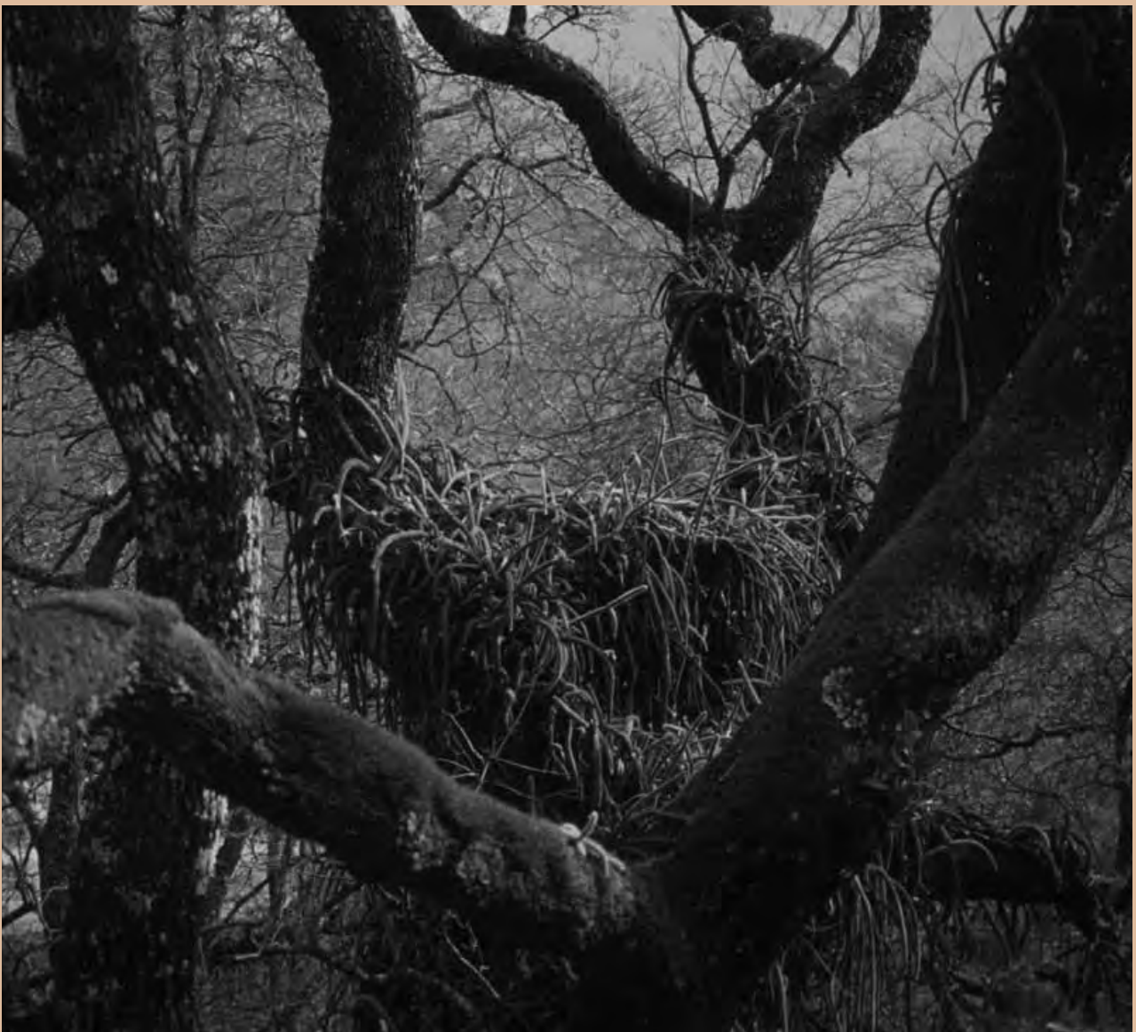
FIGURE 8 Many species of epiphytic bromeliads and orchids are still harvested from the wild across Latin America, and are sold either to plant nurseries or in local markets for household plants