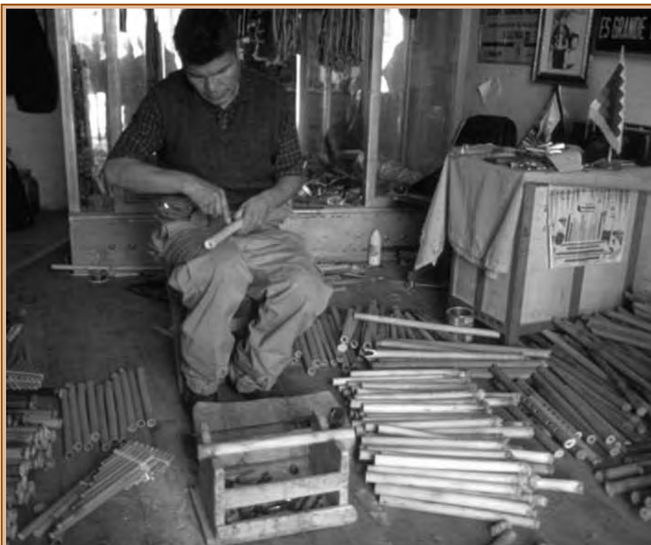
FIGURE 7 Artisan making flutes from bamboo (Bambusa guadua)