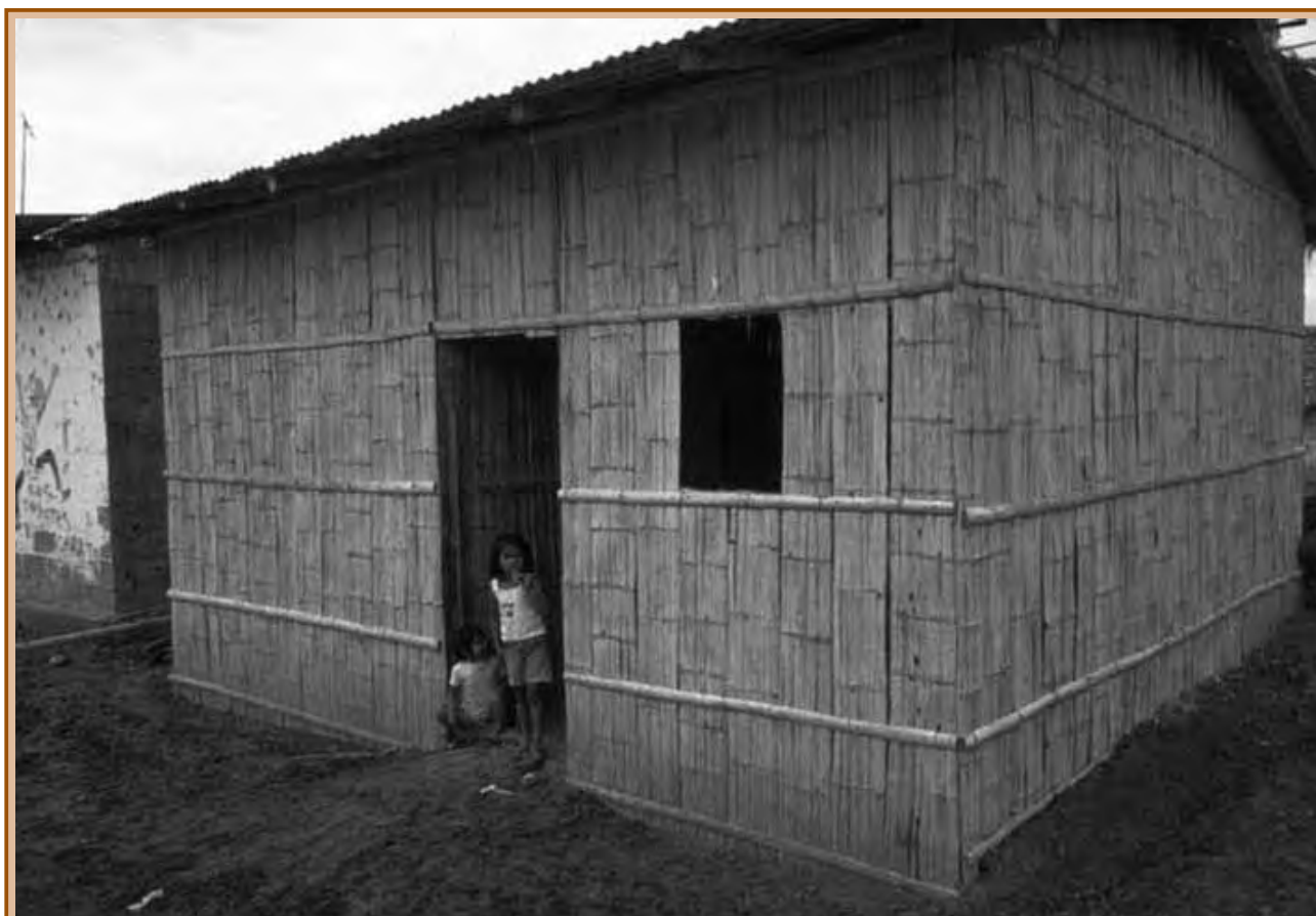
FIGURE 4 Bamboo ( Bambusa guadua ) is used to build houses, Ecuador.

tannin is required. Australian wattle ( Acacia mearnsii and A. decurrens ) is cultivated in some tropical countries (e.g. India, Kenya) for its tan bark; the heartwood of Acacia catechu and the nuts of Areca palm ( Areca catechu ) are important sources of tannin in some Asian countries; and Gambir, or white cutch, is a resinous substance extracted from the leaves and young branches of Uncaria gambier , a climbing shrub of the Malayan peninsula and Indonesia. In addition, several mangrove species ( Rhizophora spp. ) are also rich in tannin.