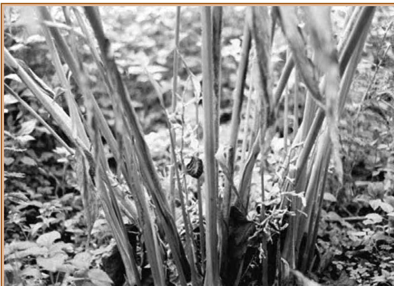
FIGURE 9 Cardamom (Elettaria cardamomum) plant with fruits

Sustainable yields vary considerably between different species and are influenced by which parts of the organism are harvested, as well as the ecological and demographic characteristics of the species. In addition, security of tenure may influence harvesting intensity, with open access production systems resulting in no specific group assuming management responsibility for the resource. Many believe that increasing trade, at least initially, results in overexploitation of wild populations, leading to domestication or substitution of the product.