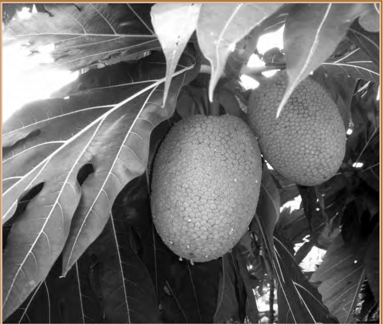
FIGURE 6 Breadfruit (Artocarpus altilis) leaves and fruit

new ones. NWFP activities are often wholly combinable and compatible with other natural resource uses, including forestry, agriculture, and conservation.