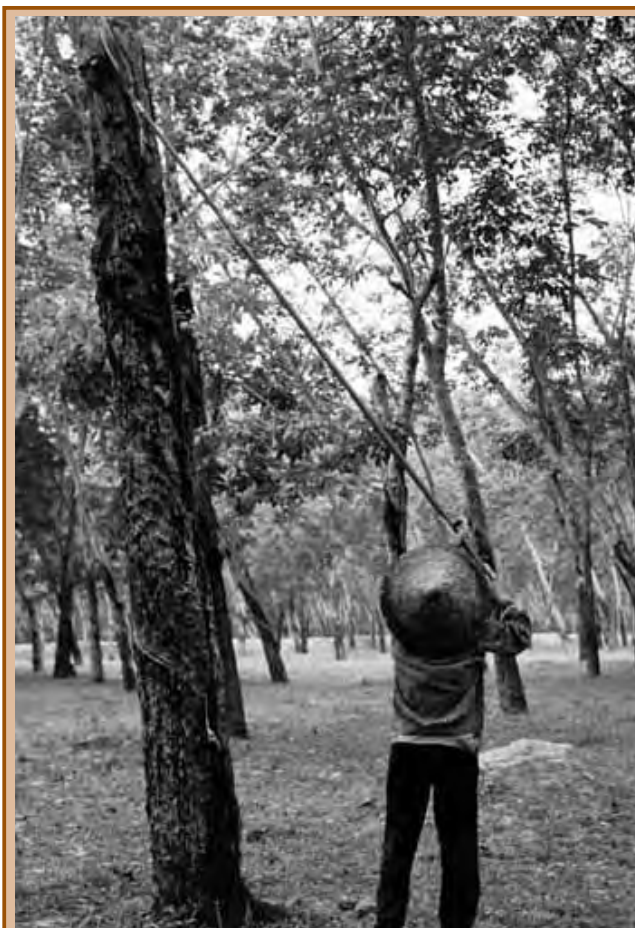
FIGURE 3 A worker tapping latex from an old rubber tree in Viet Nam

Important gum-producing species include Acacia senegal , Sterculia urens , Astragalus spp., and Strychnos potatorum , Caesalpinia spinosa , Prosopis juliflora , and Ceratonia siliqua . Gums have diverse applications in the pharmaceutical, cosmetic, food additive, printing and textile industries. Although many synthetic products have replaced the uses of natural gums, their use continues for specific purposes. Gums permitted for use in foodstuffs command high prices, but are subject