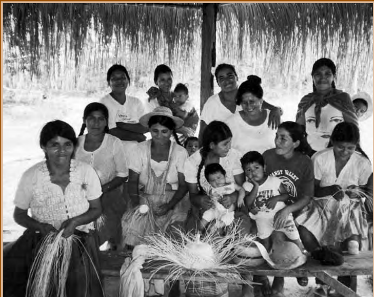
FIGURE 12 Women members of a Jipi Japa Weavers' Association in Bolivia benefit from the guaranteed purchase of their products, and also have access to additional social benefits

Both natural abundance and reproductive rates are species dependent, and vary enormously across different NWFPs. The first