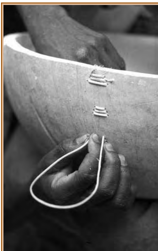
FIGURE 10 Detail of Parkia Biglobosa bean fibre, used in repairing a vessel made from calabash gourd (Lagenaria siceraria)

At the subsistence level, most NWFPs are consumed immediately after harvest or with minimal processing. When trade begins,