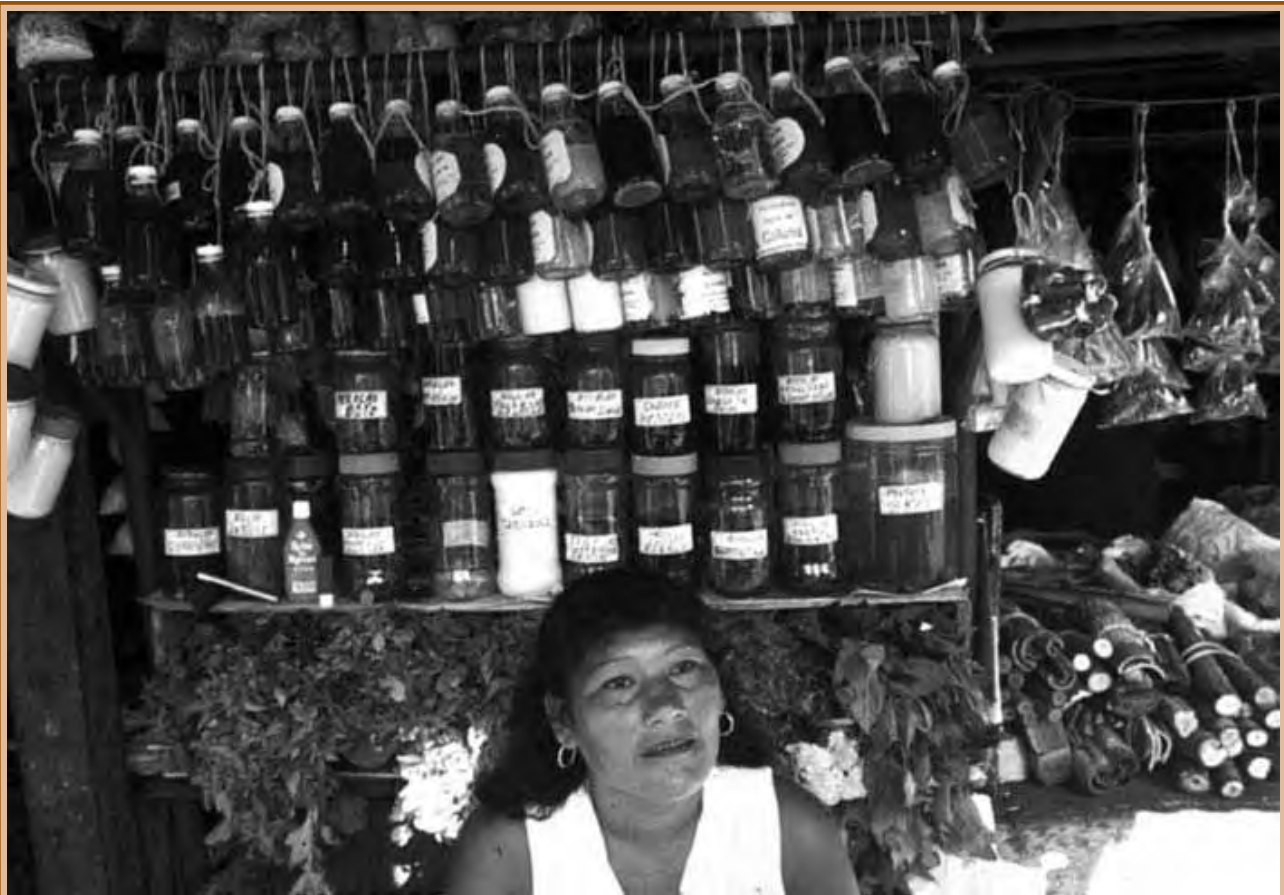
FIGURE 11 Selling of all kinds of traditional oils, creams, ointments and medicines in a market in Brazil