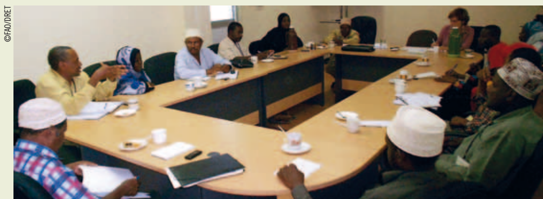
Capacity Needs Assessment, Zanzibar, Tanzania, 2011.

The final product of the assessment was a roadmap for the capacity development activities on DRE to be supported by FAO and other national and external partners.