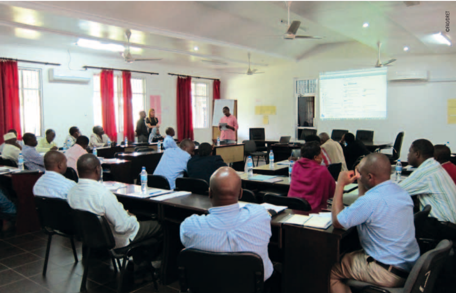
Capacity development workshop, Tanzania, 2012.