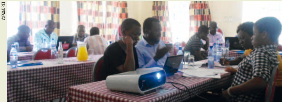
Capacity development workshop, Tanzania, 2012.

All three workshops were attended by a wide range of policy makers and implementers, as well as senior technical staff from key national institutions in Malawi and Tanzania. In total, some 150 individuals have benefited from these activities. The selection of participants through the three workshops guaranteed the continuity in the participation of selected officers from the main partner institutions, thus optimizing the provision of capacity development support.