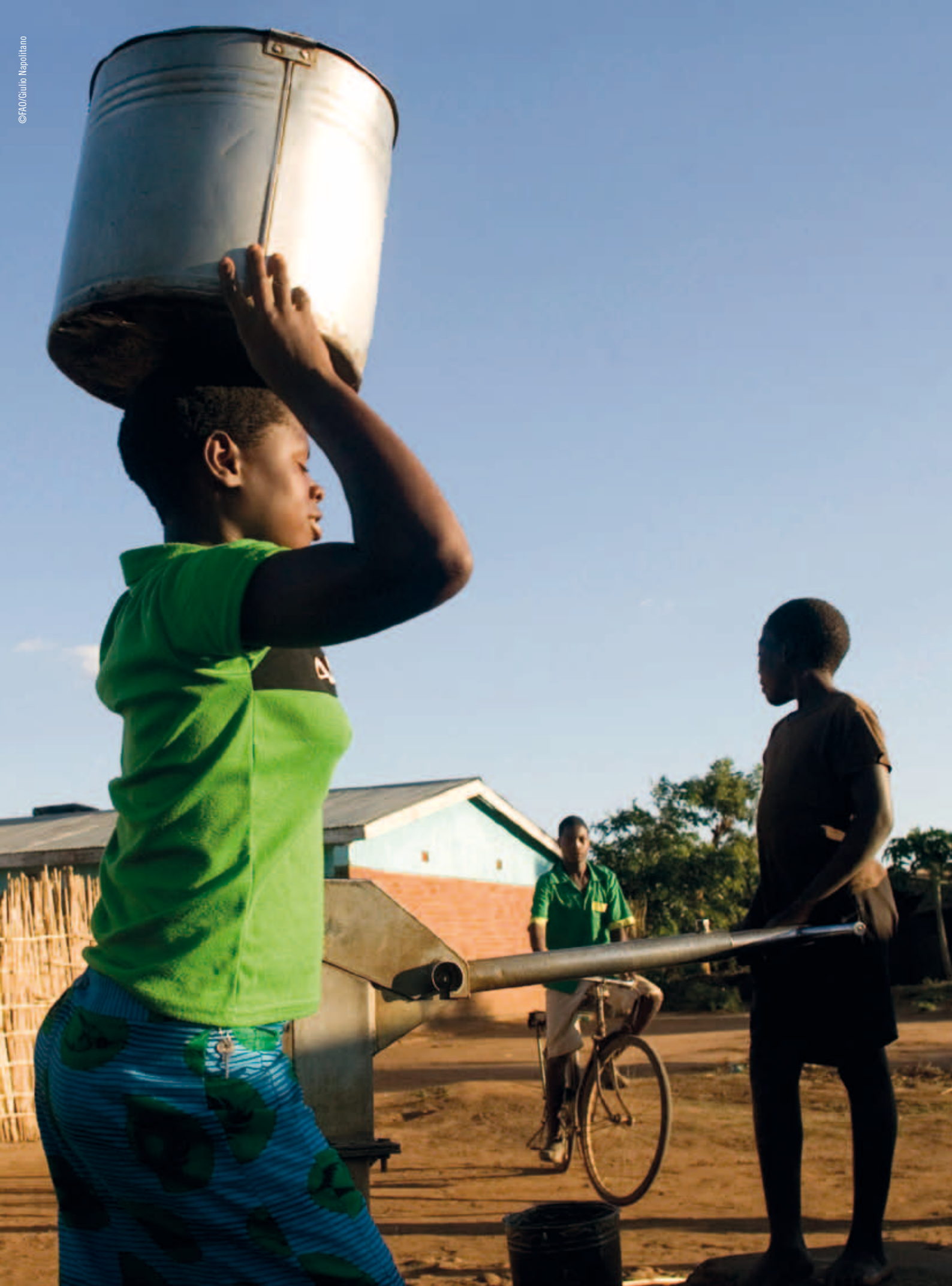
Boys and girls at work in M'njolo Junior Farmer Field Life School, Kalumbu's area in Lilongwe rural east, Malawi.