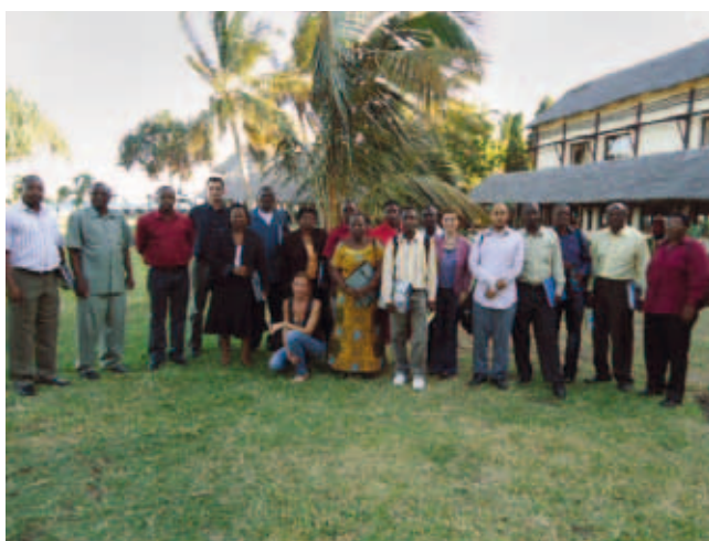
Launching Workshop in Malawi, 2011.

* The activity was led by the gender team in FAO headquarters.