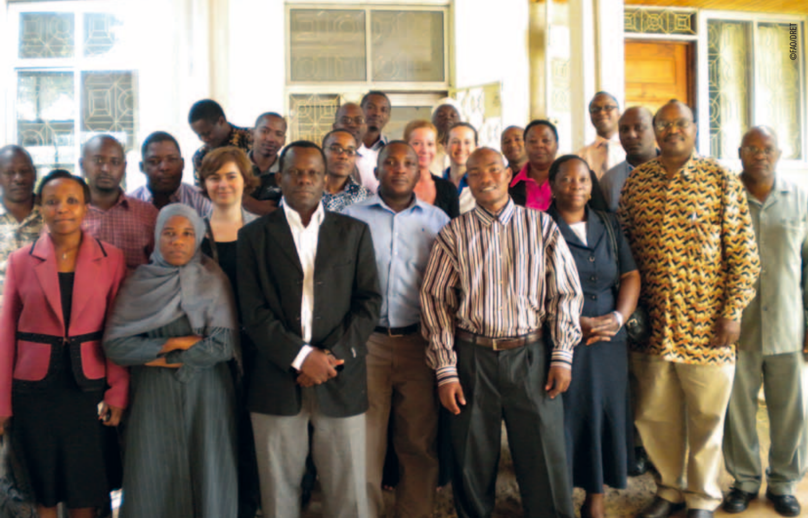
Launching workshop, Tanzania, 2011.