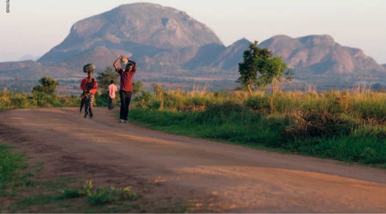
On the way back to Lilongwe from M'njolo Junior Farmer Field Life School / Lilongwe, Malawi, 2008.