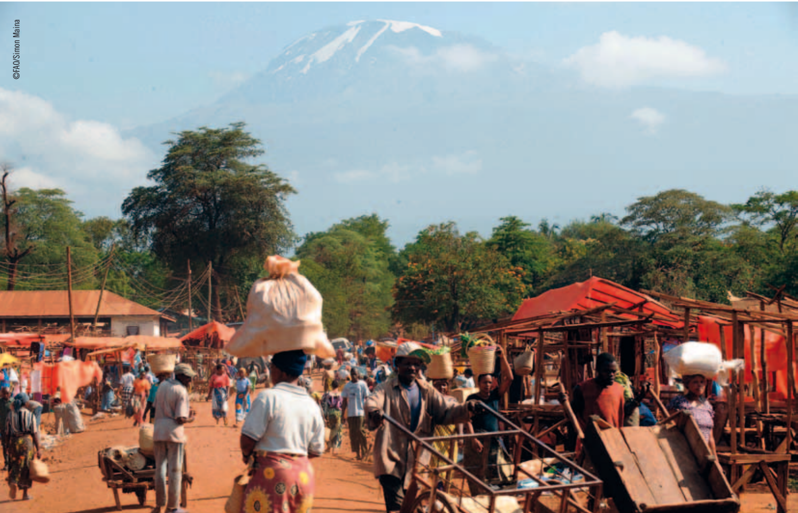
A local market scene with a view of Mountain Kilimanjaro / Moshi, Tanzania, 2012.