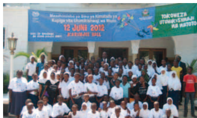
World Day Against Child Labour, Tanzania, 2012.

To develop capacities to address child labour in fisheries in Malawi, FAO and ILO supported the Ministry of Agriculture and Food Security and the Ministry of Labour in holding stakeholder consultations and capacity development workshops on Small Scale Fisheries Management. The main conclusions were used in developing the FAO-ILO document " Guidance on addressing