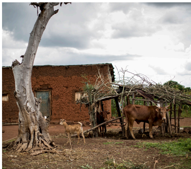
Girinka has expanded significantly and now covers all districts in the country. By 2017 Girinka is expected to have benefited 350 000 families.

In 2008 the Government launched an innovative social protection programme, the Vision 2020 Umurenge Programme (VUP). A