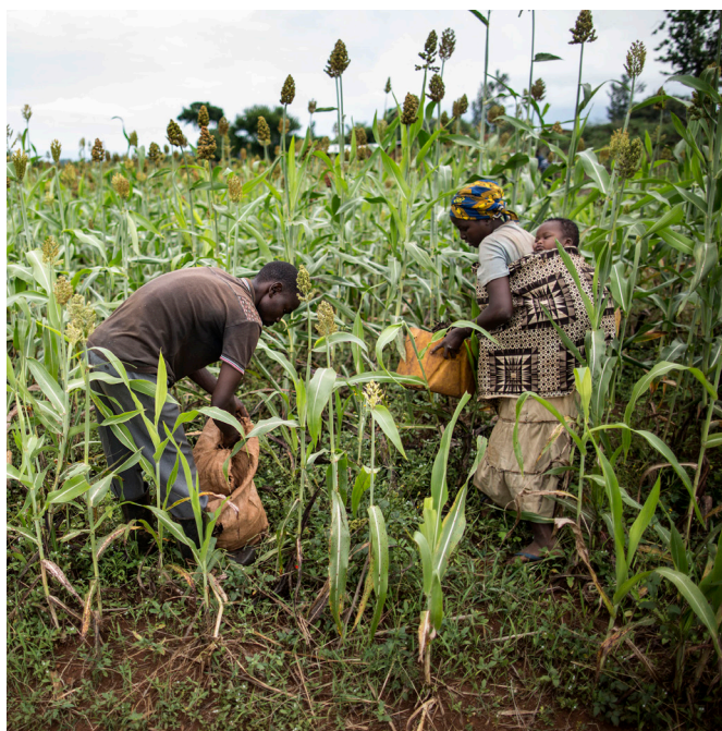
Farmers learn how to diversify their farming techniques in order to allow different crops to grow in alternated and spaced out cultivation in order to maximize the production.