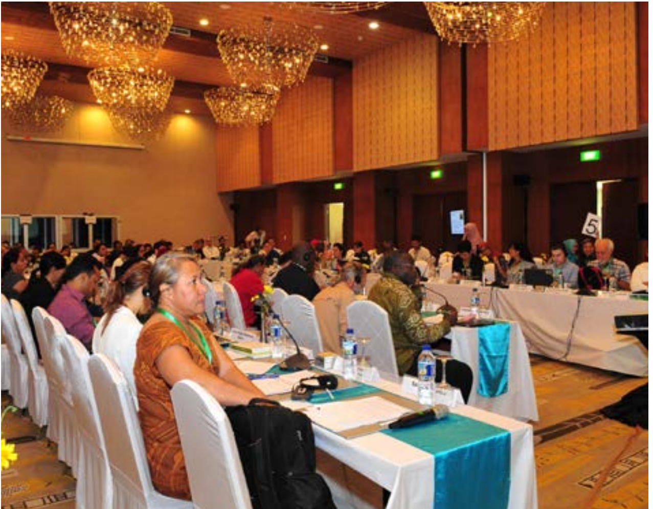
The global consultation was attended by 97 participants from 37 countries from Africa, Asia, the Near East, Latin America and the Caribbean, North America and Europe