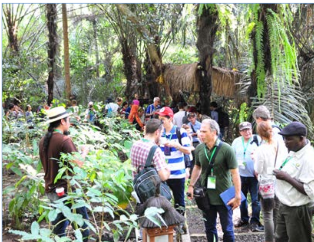
Participants at the Taman Ayu Luwak Coffee garden

given a tour of the rice fields. The second site visited was the Taman Ayu Luwak 1 Coffee garden in Gianyar. Taman Ayu Luwak Coffee is an agritourism destination that aims to introduce both conventional Luwak Coffee and its main product, Probiotic Luwak Coffee. Developed by the Indonesian Agency for Agricultural Research and Development (IAARD), this probiotic coffee includes partly digested coffee cherries eaten and defecated by the Asian palm civet or Luwak. The probiotic microbes are the result of isolating microbes in the Luwak's small intestine and appendix. The process uses exclusively natural ingredients, and is therefore chemical-free. Inside the Taman Ayu Luwak Coffee garden, participants had the chance to examine the different local herbal plants and fruits.