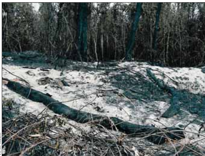
Forest edge, two days after fire