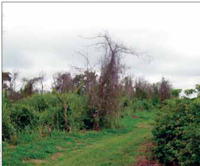
Forest edge six months after fire; burned trees and high biomass of the grass Panicum maximum are visible