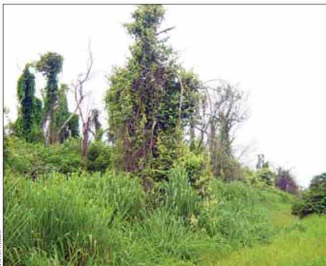
Forest edge 18 months after fire, with abundance of grasses and lianas climbing dead and living trees

vulnerability to fire and the recovery varied among species.