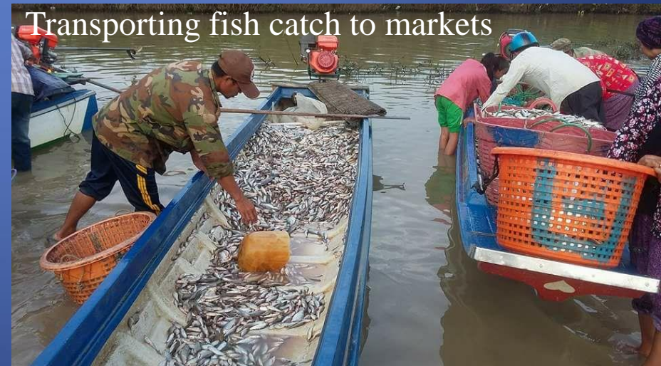
Transporting fish catch to markets