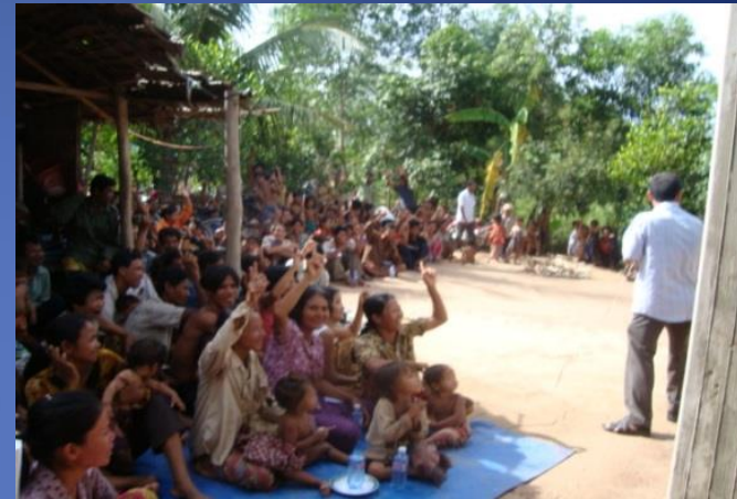
Joint making decision