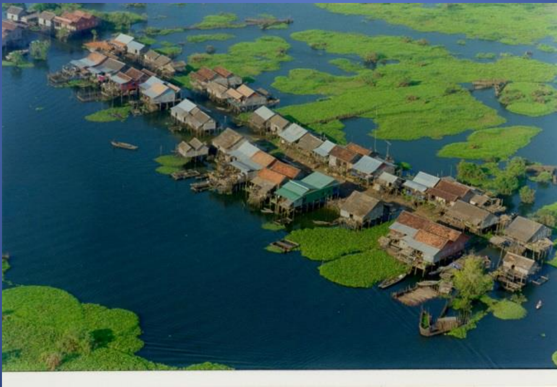
Community Fisheries Village