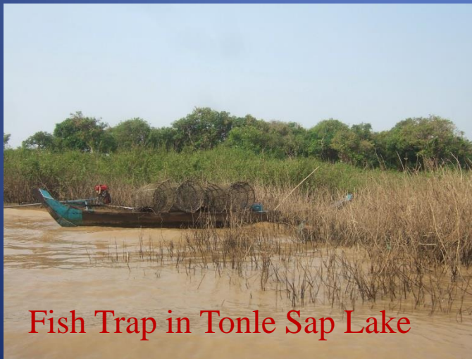
Fish Trap in Tonle Sap Lake