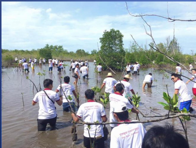
Replanting aquatic forest