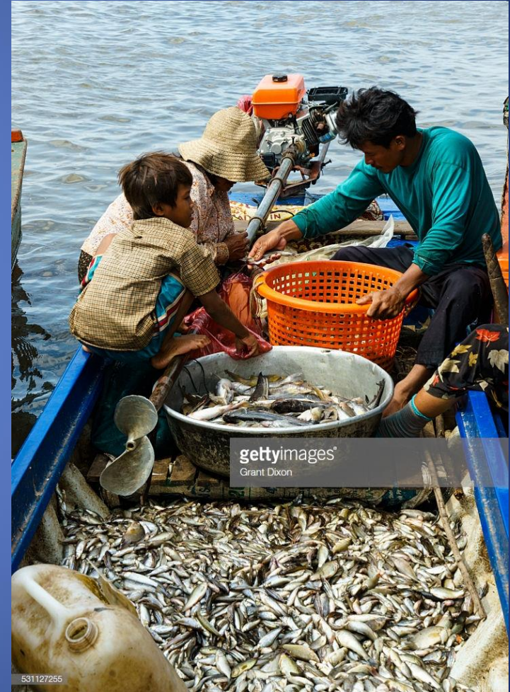
Fishing boat in Tonle Sap, Cambodia