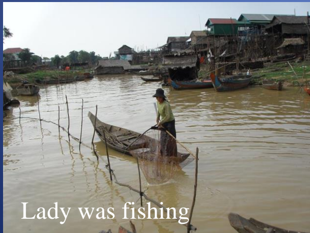
Lady was fishing