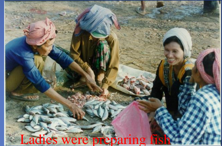
Ladies were preparing fish