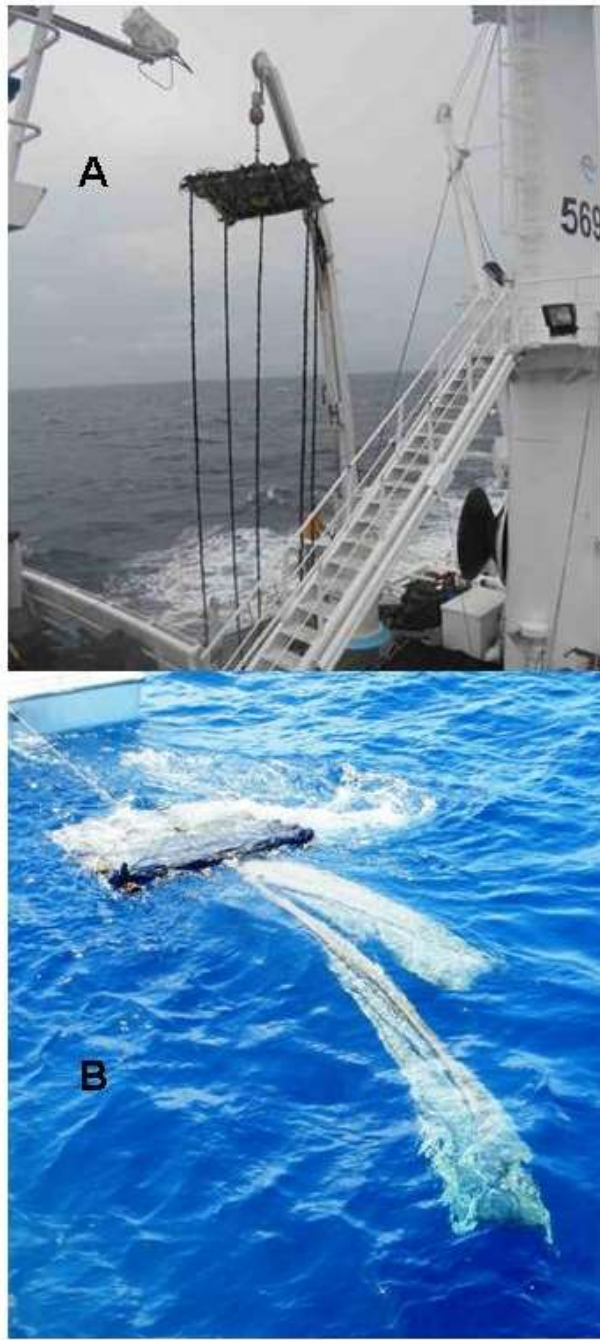
Figure 2. Non-entangling FAD used during this study (Top, A) and Entangling FAD (mesh surface and hanging open) with a tail of nets underneath that is used traditionally in the purse seine tuna fishery in the Indian Ocean (Down, B).