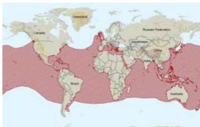
Fig. 1. Shortfin mako shark: The worldwide distribution of the shortfin mako shark

Shortfin mako shark ( Isurus oxyrinchus ) is widely distributed in tropical and temperate waters warmer than 16°C (Fig. 1) and is one of the fastest swimming shark species. It is known to leap out of the water when hooked and is often found in the same waters as swordfish. This species is at the top of the food chain, feeding on fast-moving fishes such as swordfish and tunas and occasionally on other sharks. Table 3 outlines some of the key life history traits of shortfin mako shark in the Indian Ocean.