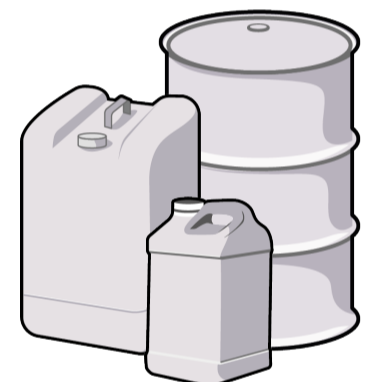
Containers with ULV insecticides