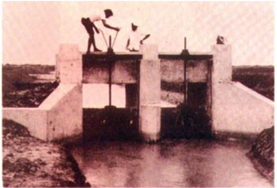
iwo-vent main sluice