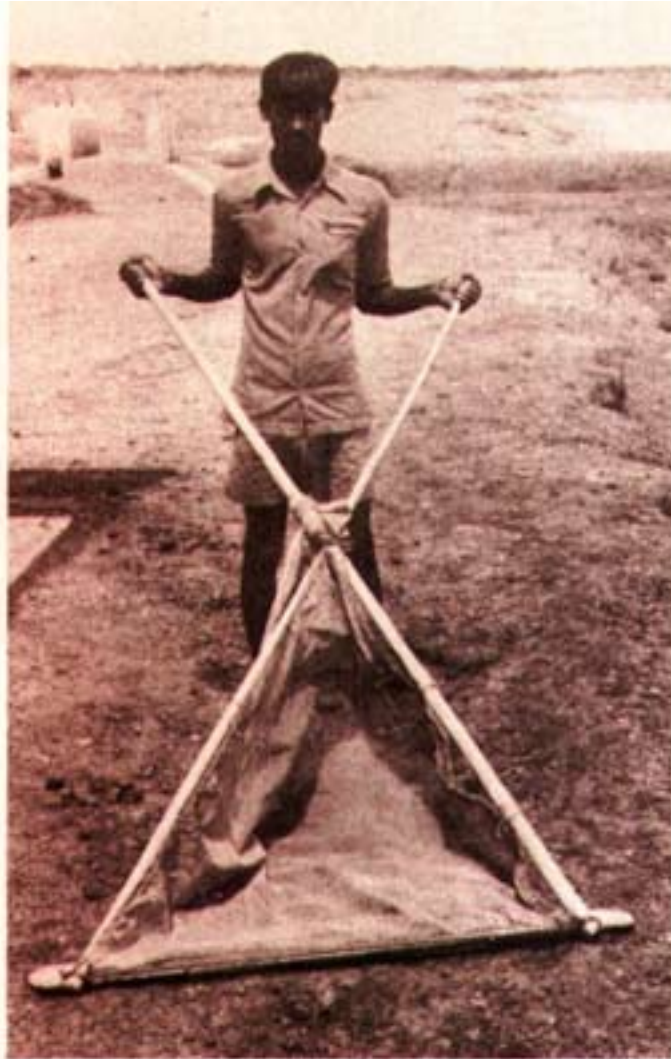
Left above: Shrimp seed collector with bucket, handnet and bike Right: Pushnet with wooden frame Below: Catching tiger shrimp juveniles