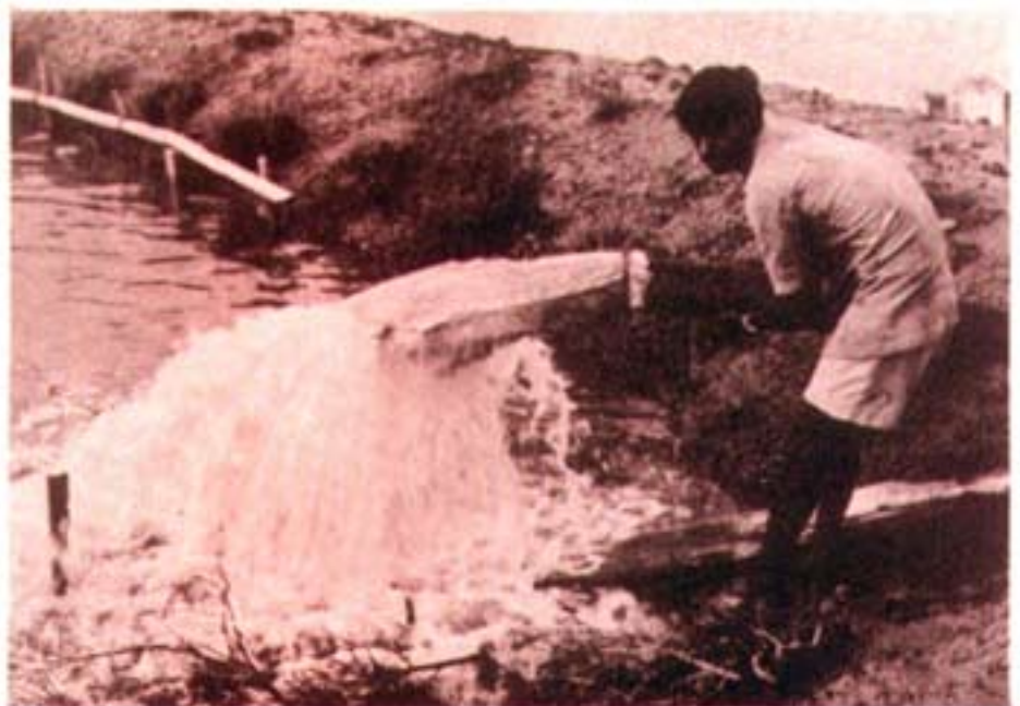
Aeration in pond 6 by pumped water