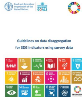
Guidelines on data disaggregation