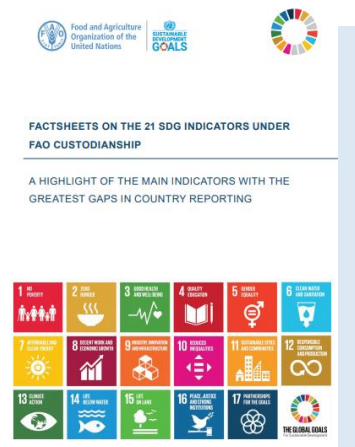
Factsheets on the 21 SDG indicators