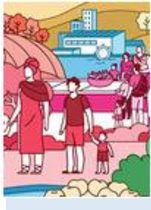
SDG Digital Progress Report