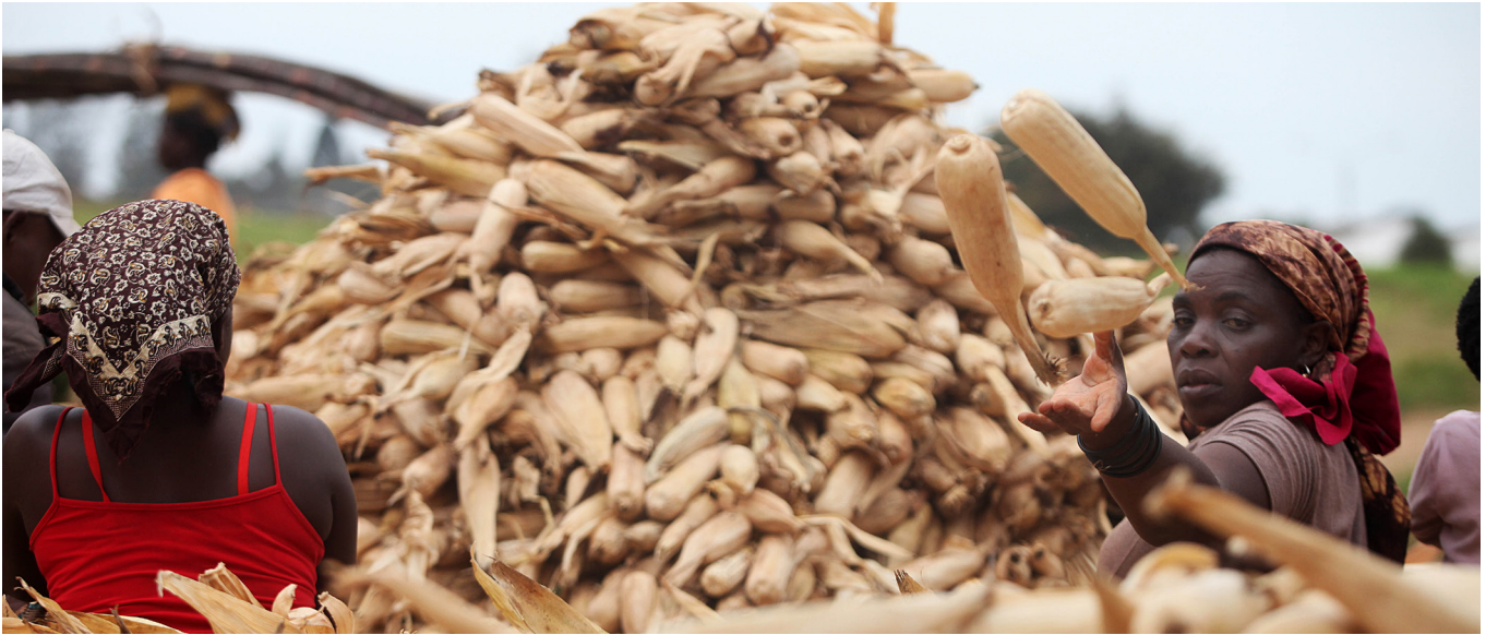
Women sheathing a pile of corn after harvesting season. The Agricultural Input Subsidy Programme used a voucher system to give farmers a maize input pack (12.5 kg seed and 2 bags of fertilizer)

Action Plan for Food Production Programme (PAPA), 1 600 tons of improved maize seeds and 2 000 tonnes of rice seeds to almost all the provinces, and 150 tons of soya seeds to couple of provinces. 6 The PAPA programme was launched in 2008 to offset the food crisis; the main objective was to reduce imports of rice, wheat and potatoes by 50 percent by 2011 through technical assistance (irrigation, farm implements, improved seeds, fertilizer and pesticides).