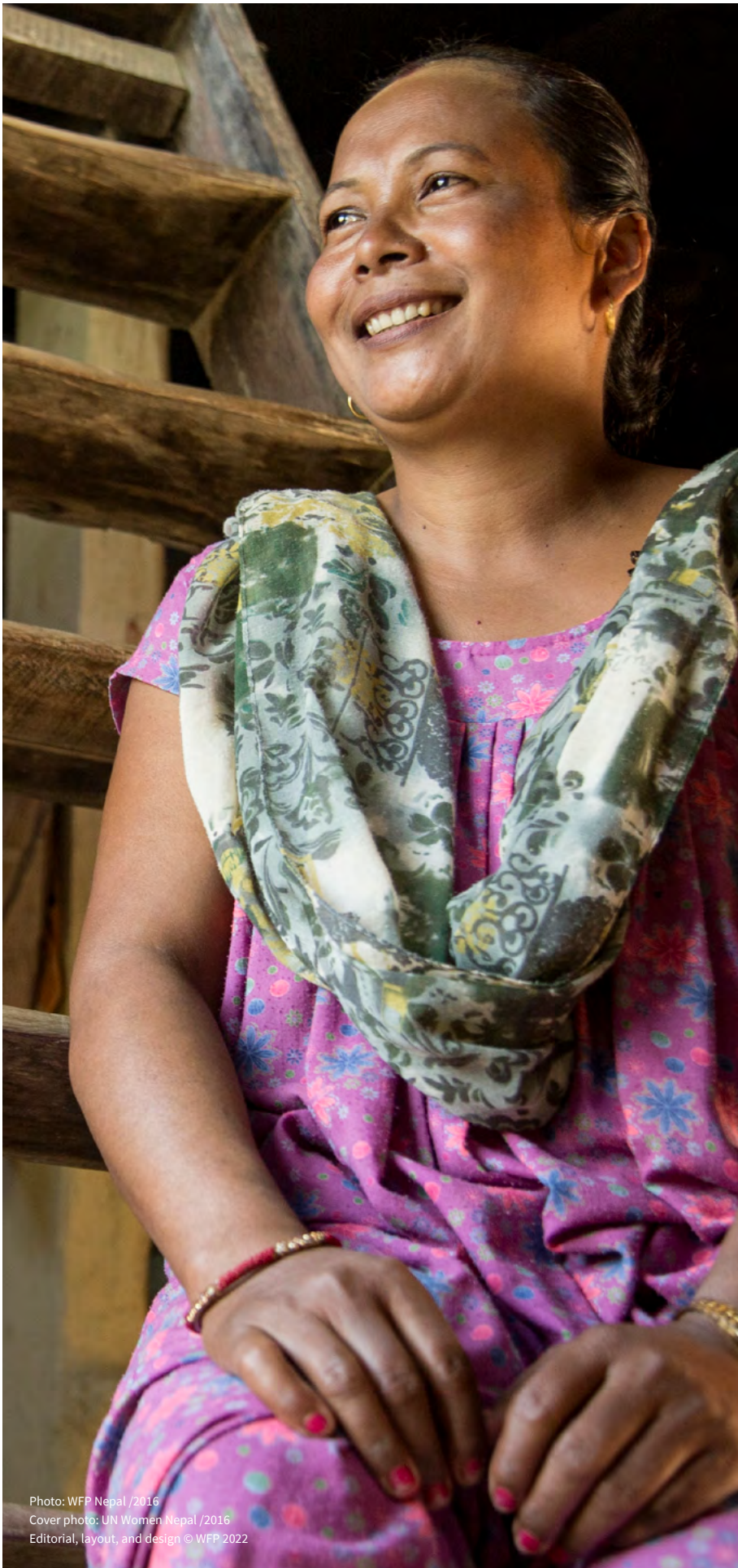
Editorial, layout, and design © WFP 2022