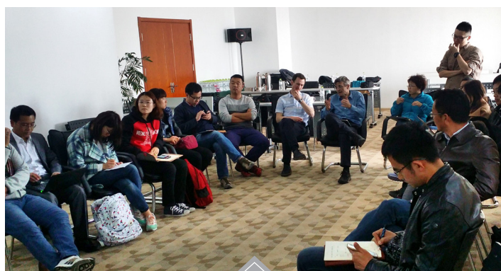
International and Chinese trainers having a hot discussion

The Module 4 of the 3 rd cohort of the China Field Epidemiology Training Program for Veterinarians (CFETPV) was held in Qingdao from 5-29 April 2016. The key objective of 4-week training was to help trainees to consolidate and integrate veterinary epidemiology knowledge learnt from the previous training modules and in field practice, thereby enabling the trainees to effectively tackle animal health problems and apply the knowledge they learnt to their daily work with confidence.