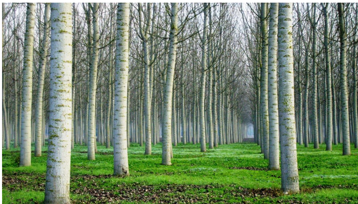
Figure 1. 'I-214', an Italian clone of Populus ×canadensis Moench, is the best example of a widely adapted selection (CRA-PLF in Casale Monferrato, Italy).

Extensive breeding programs have been carried out at Argentina's National Institute of Agricultural Technology (INTA, Buenos Aires) (Ragonese and Alberti, 1958; Pourtet, 1959; Ragonese, 1976) and at the Botanic Gardens of the Ural Branch of the Russian Academy of Sciences in Yekaterinburg, where the Salicetum has been maintained since the 1960s managing germplasm for breeding efforts and promoting clone selection for landscape uses, basketry, furniture production, and revegetation (Shaburov, 1986; Shaburov and Belyaeva, 1995). Novelty clones with straight trunks and long stems, high flexibility and density, rich in tannin content as well as cold-hardy ornamental hybrids suitable for revegetation in northern climates were developed there.