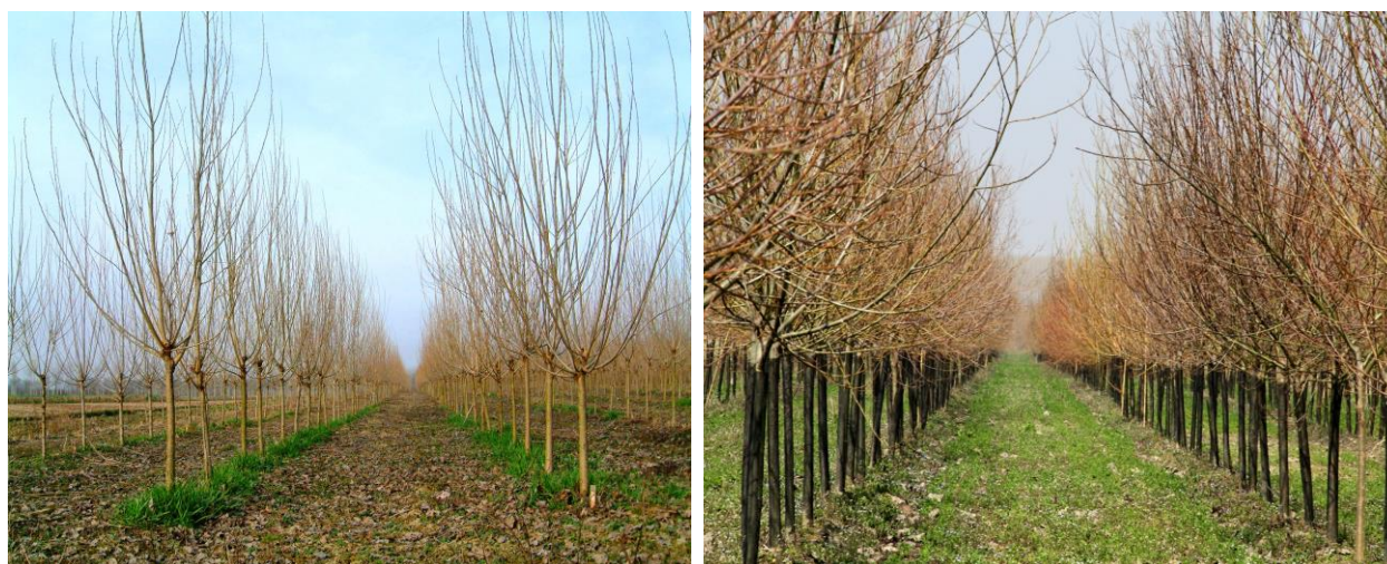
Figure 2. Populus nigra L.(left) and Salix cultivars (right) collections at CRA-PLF in Casale Monferrato, Italy.

clones with useful traits. When revitalization of poplar and willow cultivation took place in the mid-1980s, a new wave of breeding efforts was initiated. Exploitation of the wide biological variations within these genera introduced numerous traits important for biomass production, including high yield, resistance to leaf rust, insects, and frost, improved growth habits and also improved technical characteristics related to wood quality: viscosity, moisture content, wood density, and fiber length, etc.