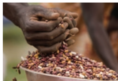
Helping smallholder farmers with quality seed.