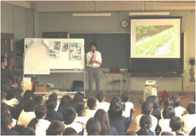
A school-delivery class at a local elementary school

We will do this in partnership with each municipality’s schools using the budgets of Tokushima Prefecture, the municipalities and each school board. There were 2 such cultural projects in 2016 but we aim to have 10 per year by 2021.