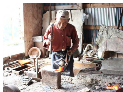
Blacksmith making agricultural tools for slopes

Sustaining blacksmith operations is particularly important in passing on the region's unique agricultural tools. The Tokushima-Mt. Tsurugi GIAHS Promotion Association and the town of Tsurugi are holding blacksmith workshops, but we will continue to nurture successors through blacksmith workshops.