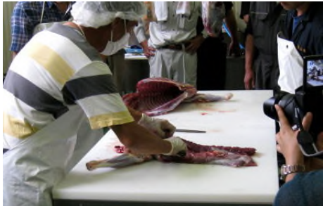
Game meat processing facility

We will also work with hunting clubs, meat processing facilities, restaurants and chambers of commerce to bring the 2016 cumulative total of 631 processed animals and 16 game meat restaurants to 850 and 20 respectively by 2021.