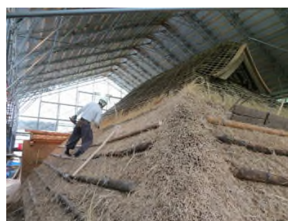
Thatched roof repair

Furthermore, we will use the Conservation Bank (PES) to maintain the kaya grasslands in collaboration with city residents to preserve the landscape and biodiversity.