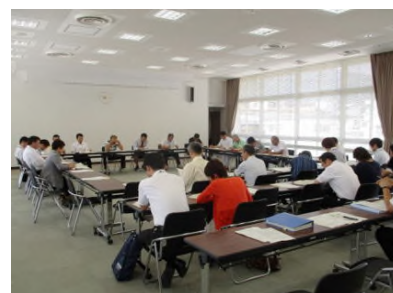
Togenkyo Business Study Group

Focusing on this study group, we will create new businesses and services connecting the diverse industries of food, farming and tourism.