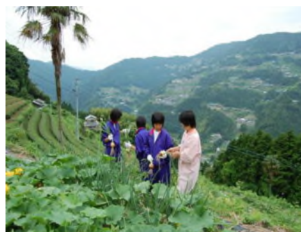
Farm-stay agriculture experience

We will also increase the number of nights stayed by creating village travel services, doing promotions in Japan and overseas, developing a network of farm-stay facilities and increasing convenience and service quality.