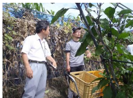
Supporting new farmers

Agri-tech schools run by Tokushima Prefecture will support education on farming techniques and management. After beginning farming, prefectural instructors will offer one-on-one instruction for a more hands-on education.