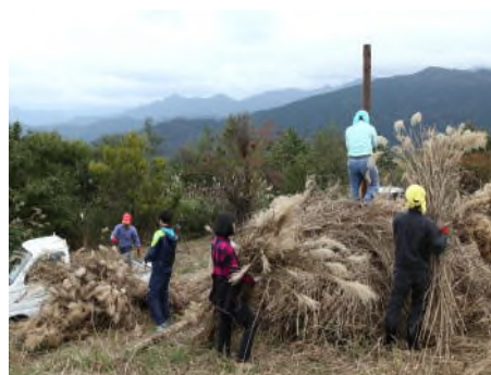
Diverse stakeholders making haystacks

We will also use the Conservation Bank to encourage grassland management as we promote farm-stays, attract new and returning farmers and partner with companies and universities.