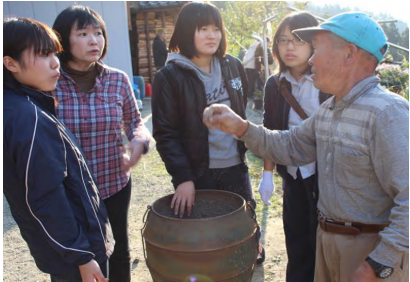
Sobagome (buckwheat rice)

From sobagome zosui (buckwheat porridge) to preserved foods such as dried foods, this region is home to a diverse food culture. In order to pass on this culture and its techniques to the next generation, we will hold workshops led by regional agricultural groups on topics such as how to make sobagome (buckwheat rice) and dry foods.