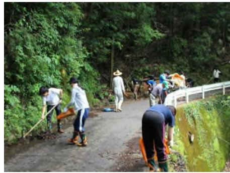
Landscape beautification activities by a sponsor company

Furthermore, the government will lead improvement of signage by standardizing design using natural colors and considering the landscape.