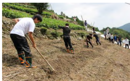
Collaboration with sponsor companies

The Mima Agricultural Cooperative Association and Awa-Miyoshi Agricultural Cooperative Association are operating and enhancing a farm service that contracts farm work to externally supplement the labor. The prefecture-led Tokushima Furusato Supporters Project also recruits collaborators from sponsor companies to help with the work.