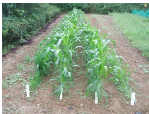
Genetic strain conservation by Tokushima Prefecture

We will also promote regional genetic resource conservation through sub-culturing and raising farmer awareness, thereby stably maintaining species diversity.