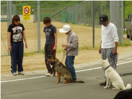
“Monkey dog” training

Furthermore, we will use the Conservation Bank (PES: p. 10) to collaborate with city residents in installing protective fencing.