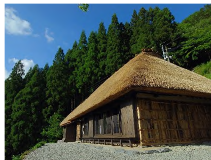
Renovated kominka accommodation

We will build on this by attracting foreign tourists seeking Japan’s “lost rural landscapes,” helping people rediscover the value of the landscape and preserving it.