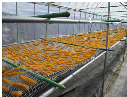
Cross-industry collaboration for dried sweet potatoes

By supporting the collective production of special products by such associations, we will pass on processing techniques and improve farmer incomes.