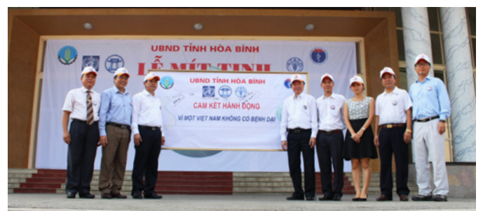
During the World Rabies Day 2014 event in Hoa Binh Province

Since 2012, FAO ECTAD Viet Nam, in partnership with World Health Organization (WHO), Ministry of Health (MOH) and Ministry of Agriculture and Rural Development (MARD) co-organized the World Rabies Day as efforts to enhance political attention. Leaders from international and national agencies, provincial people's committees collectively gathered at the annual event to express their commitment as well as called for better inter-sectoral cooperation for rabies. The World Rabies Day also mobilized community-based organizations to join effort, raising awareness to dog owners as well as the mass media.