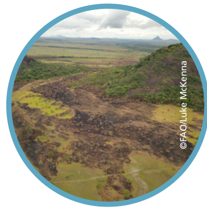
Black Rock Mountain in Shulinab Village showing visible burn scars along the transect line