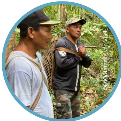
SRDC members hiking with their 'warashis' (traditional backpack made from nibbi)