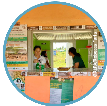
RLPA Livestock Hub opens in Aishalton Village