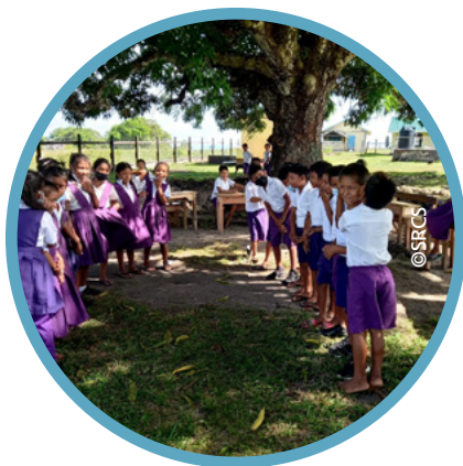
Awarewaunau schoolchildren taking part in environmental education lessons