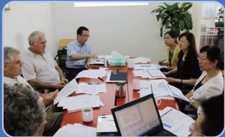
▲ Discussion on Action Plan for China FETPV in 2014

The progress of past half year was reviewed by the Steering Committee members. Activities had been accomplished according to the annual Action Plan and members are happy to see ongoing activities on the right track. The Action Plan for the second half year of 2013 was also reviewed and finalized. In the meeting, the proposed activities and new initiatives for 2014 were also discussed.