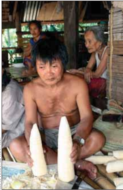
Teen Tok villagers are again able to harvest bamboo from the forest following an agreement with national park officials made during the process of conflict mediation

Forest Protection Volunteer Network with the five other villages in the cluster, to function as a community network for forest protection, forest care, forest fire watch and management for the whole forest area. Over 150 volunteers now regularly conduct forest patrols with the national park officers.