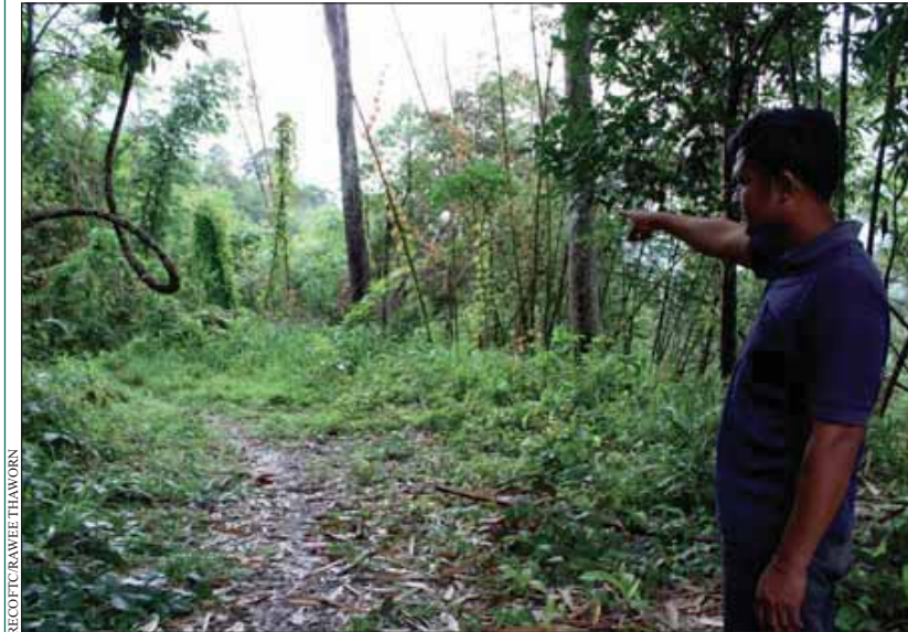
A villager of Teen Tok points to the patch of forest the community is hoping to turn into an official community forest with the support of local officials and national legislation

conservation in a globalized world. Proceedings of the National Academy of Science , 104(39): 15188–15193.