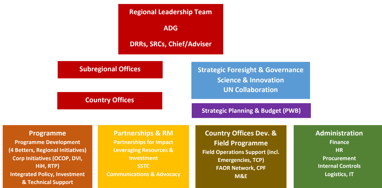
Figure 1: Regional Offices - Global Common Functional Organigramme

5. The revised set up was designed with built-in flexibility to adapt its main features to the specificity of each region. The implemented transformed structures of the Regional Office for Asia and the Pacific (RAP) and Subregional Office for the Pacific Islands (SAP), integrating some region-specific features, is provided in Figures 2 and 3 below.