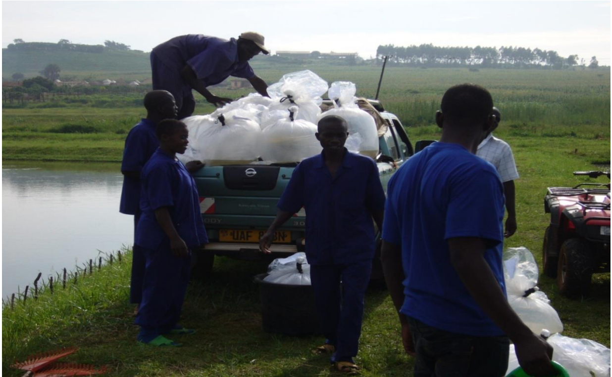
Photo 3: Delivery of fish seed by a commercial aquaculture farm (SON Fish) in Jinja