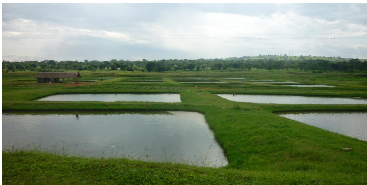
Photo 2: Nile Tilapia broodstock holding pond of a commercial aquaculture farm (SON Fish) in Jinja

However, Mr Napuru also specified that whilst the future of aquaculture as a business was bright, there were still several constraints including: