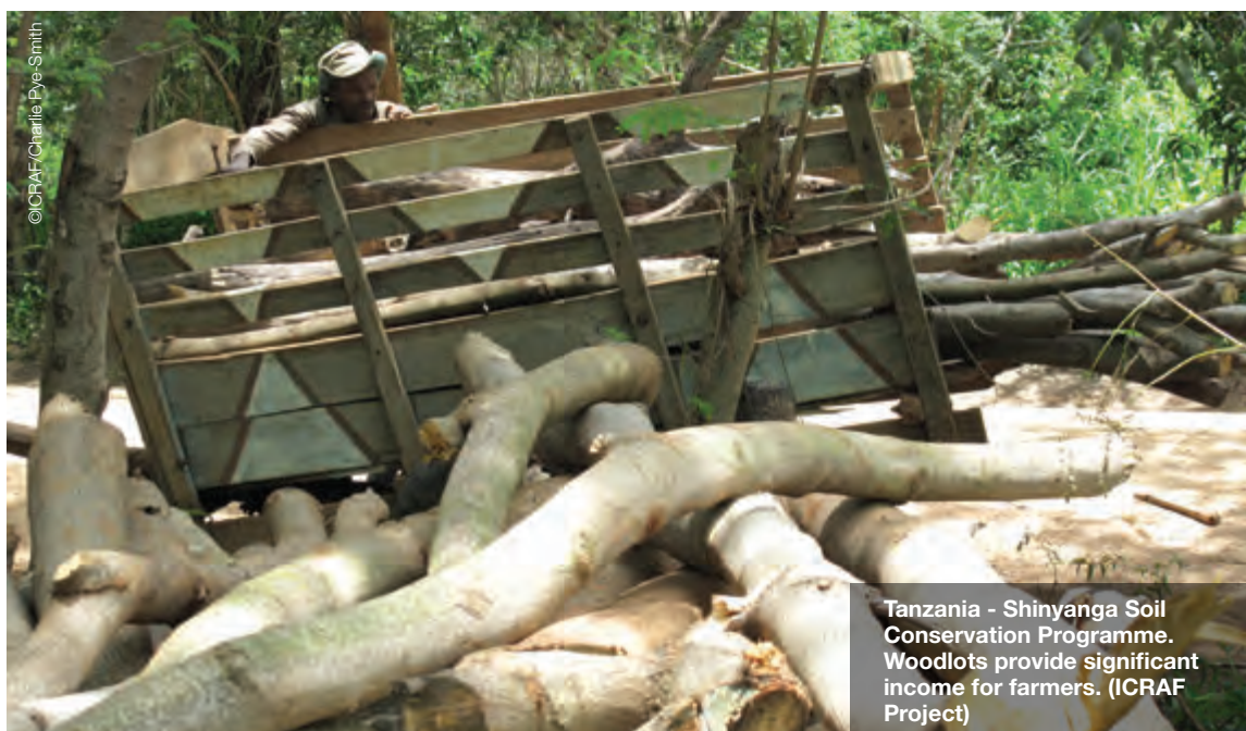
Tanzania - Shinyanga Soil Conservation Programme. Woodlots provide significant income for farmers. (ICRAF Project)

Poor regulation of state-owned and managed woodlands and forests has led to undervaluing concessions and stumpage charges, resulting in an oversupply from those sources and an undersupply from farms. A weak governance context leads to instability and eventually to unsustainability of the local economic system. It never promotes complex integrated systems such as agroforestry.