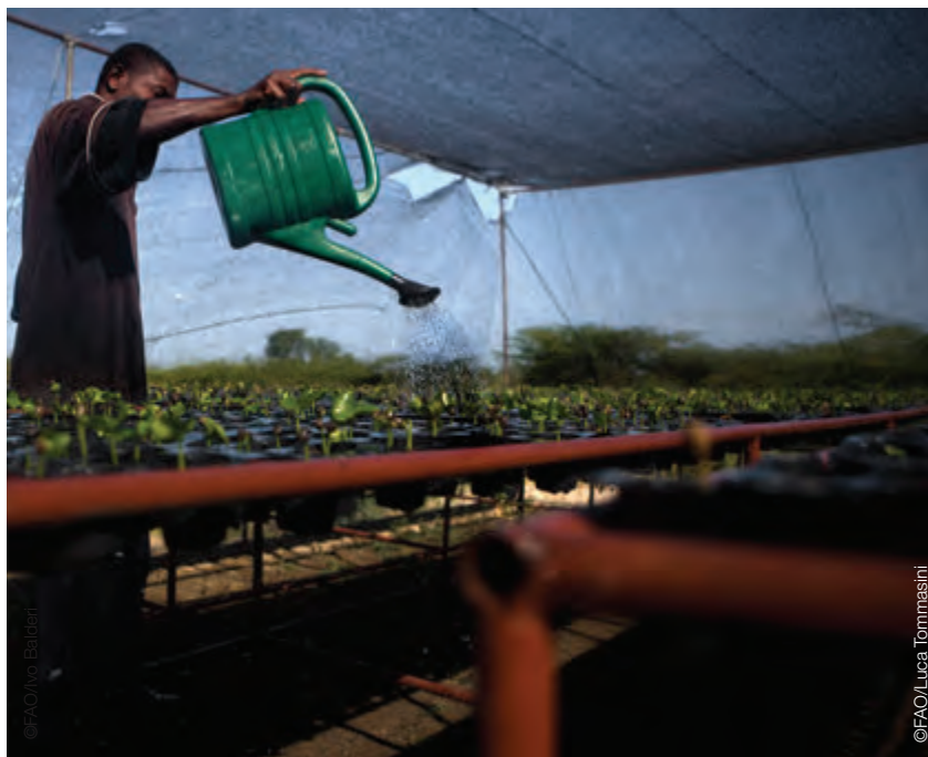
Haiti, Fort-Liberté – The manager of a local nursery watering seedlings provided by FAO along with tools and equipment to better manage the nursery. The aim of the project is to contribute to the growth and diversification of agriculture, livestock and agroforestry and improve natural resources management for the municipalities of Fort Liberté, Capotille, Ouanaminte, Ferrier, Mont-Organisé.

In a number of countries there have been attempts to harness agroforestry potential by improving the coordination of national activities, through the development of national information networks. New opportunities for agroforestry are also emerging, such as within the miombo woodlands (savannah) of central, eastern and southern Africa. This area covers 3 million km 2 over 11 countries and contributes to the livelihoods of some 100 million low-income persons. Similar is the expansion of natural regeneration of dry degraded land in the Sahelian area of Africa with the potential to mitigate climate change and increase rural income; in Niger, new legal conditions encouraged farmers to manage natural tree regeneration, leading to over 5 million hectares of newly generated parkland systems. In the United States, where agroforestry is not universally adopted, there is growing recognition of its ability to help farmers, ranchers, woodland owners and indigenous people to integrate productivity and profitability with environmental stewardship, culture and traditions.