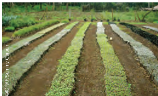
Kenya, Kisumu – An ICRAF pilot initiative exploring the potential benefits offered by urban agroforestry. The aim is to integrate agroforestry technologies into present peri-urban and urban farming practices in Kisumu.

The government is also considering various options to increase agroforestry tree seed and seedling supply to meet the demand created by this regulation.