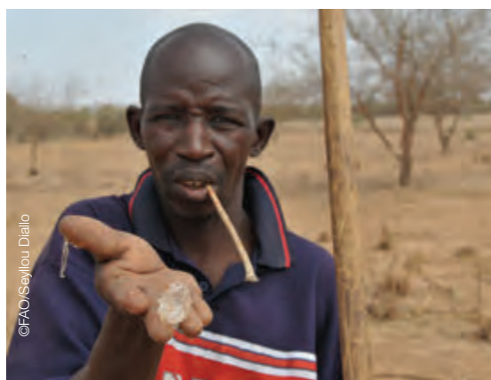
Senegal, Thikene Ndiaye - Acacia Operation. Support to Food Security, Poverty Alleviation and Soil Degradation Control in the Gums and Resins Producer Countries (Burkina Faso, Chad, Kenya, Niger, Senegal, Sudan). A local villager tending a crop of acacia trees showing the sap or gum arabic that is harvested for eventual sale to a processing plant. (FAO Project)

This development, which fosters a regeneration of the whole parkland, is directly dependent on the commercial interests of the companies in charge of distribution of the product. It is questionable whether free distribution of seedlings to farmers is a good solution, as it creates economic and technical dependency instead of promoting innovative behaviour. However, this case provides an example of a situation in which the maintenance of trees in rural areas derives directly from market demand.