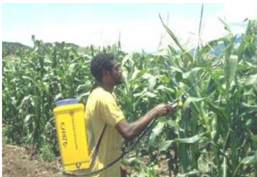
Spraying pesticides without protective clothing