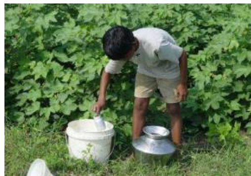
Young boy performing hazardous tasks handling pesticides for application