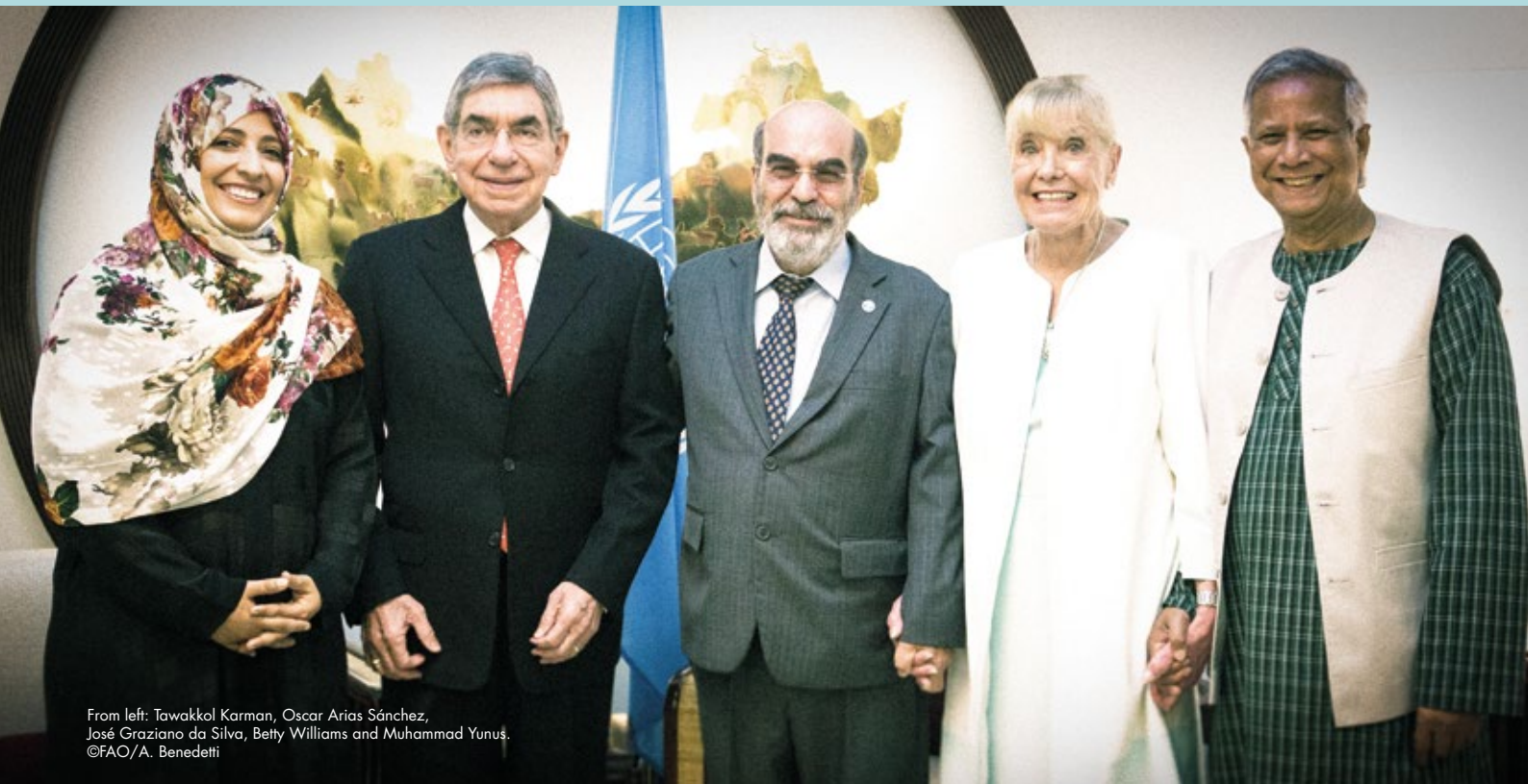
From left: Tawakkol Karman, Oscar Arias Sánchez, José Graziano da Silva, Betty Williams and Muhammad Yunus.

On 11 May 2016 , the FAO Director-General convened a meeting with Nobel Peace Laureates to discuss how peace is a prerequisite for achieving food security for all, and how improving food security can contribute to peace and security.