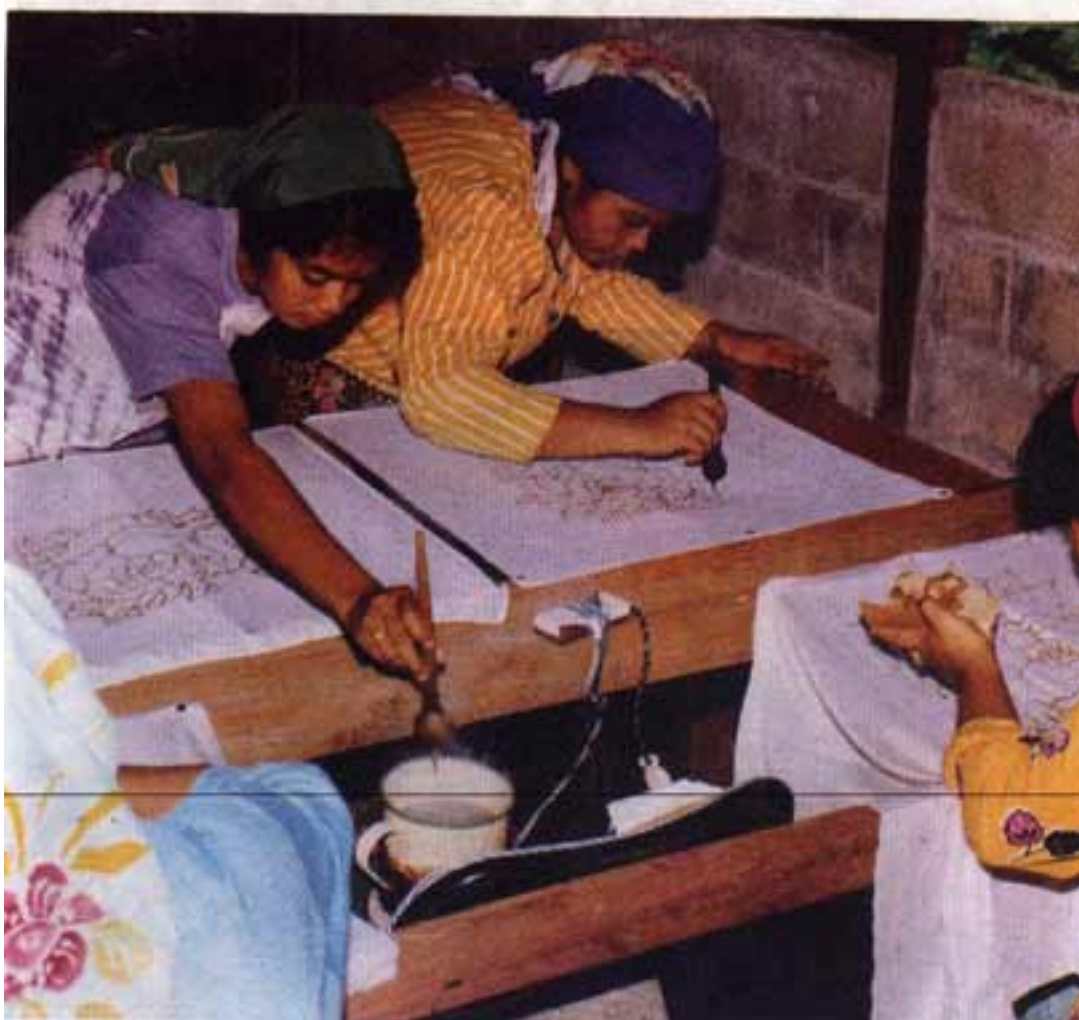
Batik production by women: turning art into money