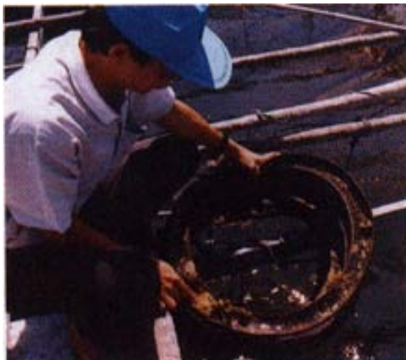
Luring oyster spat with old motorcycle tyres for culture