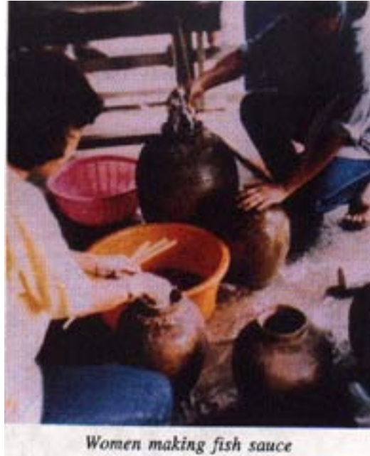
Women making fish sauce

Women in selected fishing communities were provided skill training, management training, credit support and assistance in marketing to enable them to set up microenterprises and, thereby, enhance their incomes. The activities included fish preservation, fish-based products, sewing and crochet, macrame, hair-styling, running village stores and batik production. The skill training was successful and incomes did go up, though a part of it was due to reduced expenditure from consuming their own products instead of getting them from the open market. The main problem was the ability to maintain quality and to produce enough to compete successfully in urban markets.