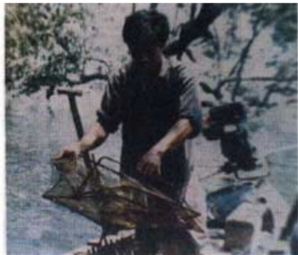
Fisherman laying a new crab trap