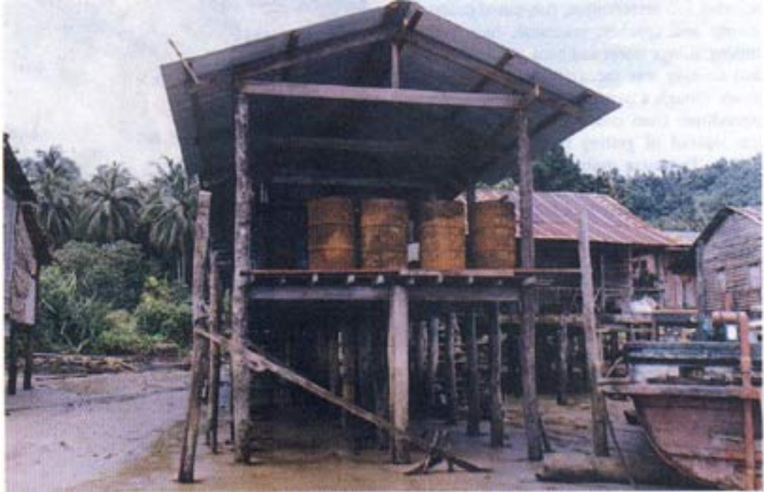
Petrol distribution shop run by a fisherfolk group

Finding no sources of institutional credit (without collateral), the subproject resorted to setting up village-based revolving funds. They functioned well, although the sustainability of such schemes without continuous supervision remains to be ascertained.