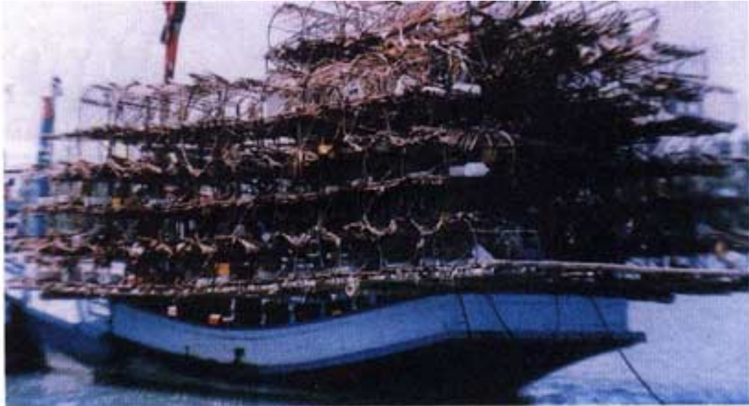
Fishing boat setting out with squid traps

In the area of capture fisheries, the subproject worked on crab traps and squid traps. A type of collapsible, metal crab trap was introduced which lasted longer, had improved catch rates and reduced the time that fisherfolk had to spend watching the traditional traps. The technology was successful and was accepted after a few failures. The only concern was the resource situation of mud crabs, as the average size of the crabs caught was small. The squid traps developed by the project reduced the quantity of expensive rattan used in its building, but never caught on with fisherfolk who had already invested heavily in traditional traps. Both these exercises resulted in activities focussing on resource management and awareness-building amongst fisherfolk to enable them to better manage their crab and squid resources in a sustainable way. The resource study of the mud crabs of Ranong added to the knowledge of the species.