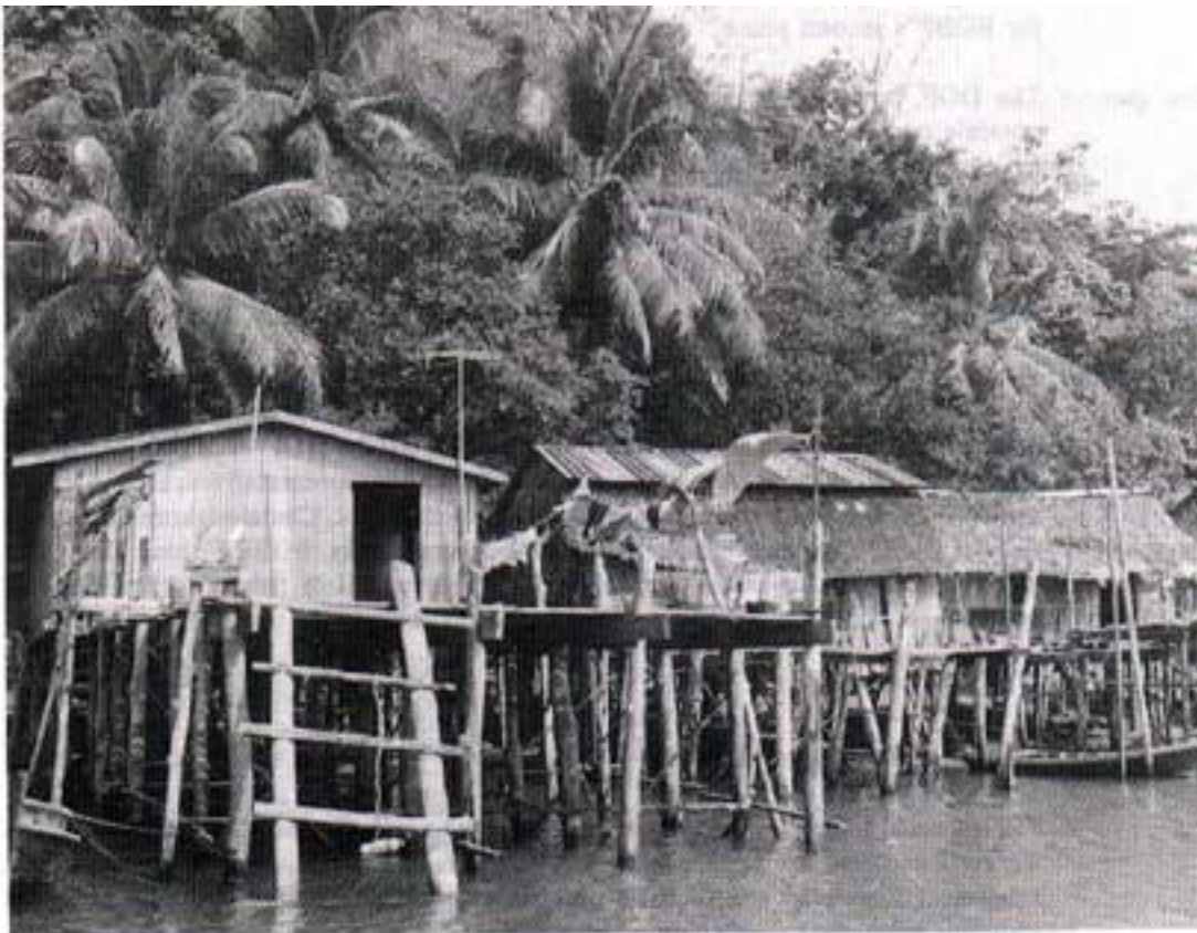
Typical fishing village in Ranong Province

Several important issues emerged during the workshops, and given the seniority of the participants and their direct involvement in policy-making, it was felt that the conclusions and consensus that evolved could well be the precursors of actual policy. A key decision at the workshop was that the guidelines developed and published by the subproject should be used both for training and as a manual by DOF extension staff in coastal provinces. The workshop concluded that the Ranong subproject was not replicable in its entirety, but that the learnings of the subproject would help the DOF by giving direction to its efforts in developing fisheries and fisherfolk in the coastal provinces of Thailand. That is a fair conclusion of the impact that the subproject has and will, perhaps, have.