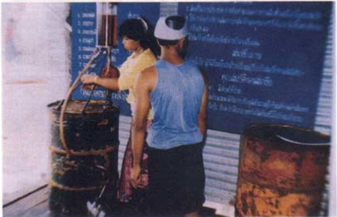
Petrol sale at shop set up by a fisherfolk group