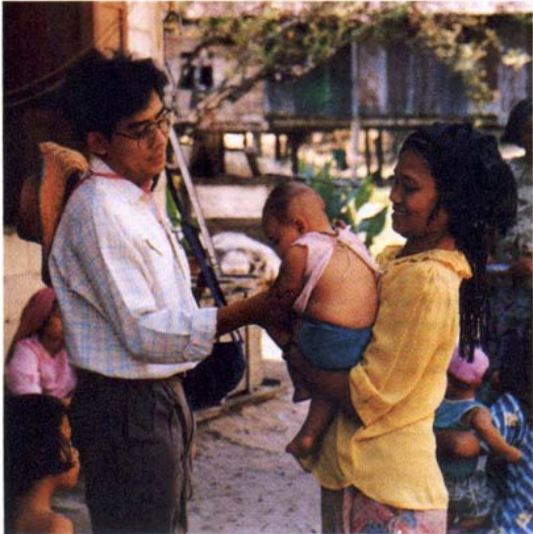
Providing healthcare access in remote fishing villages

With the cooperation of the Health Department, the Community Development Department and the Non-Formal Education Centre, the subproject facilitated the provision of social services to remote fishing villages with quite some success. It showed that with catalytic action it is possible to provide integrated development services to communities.