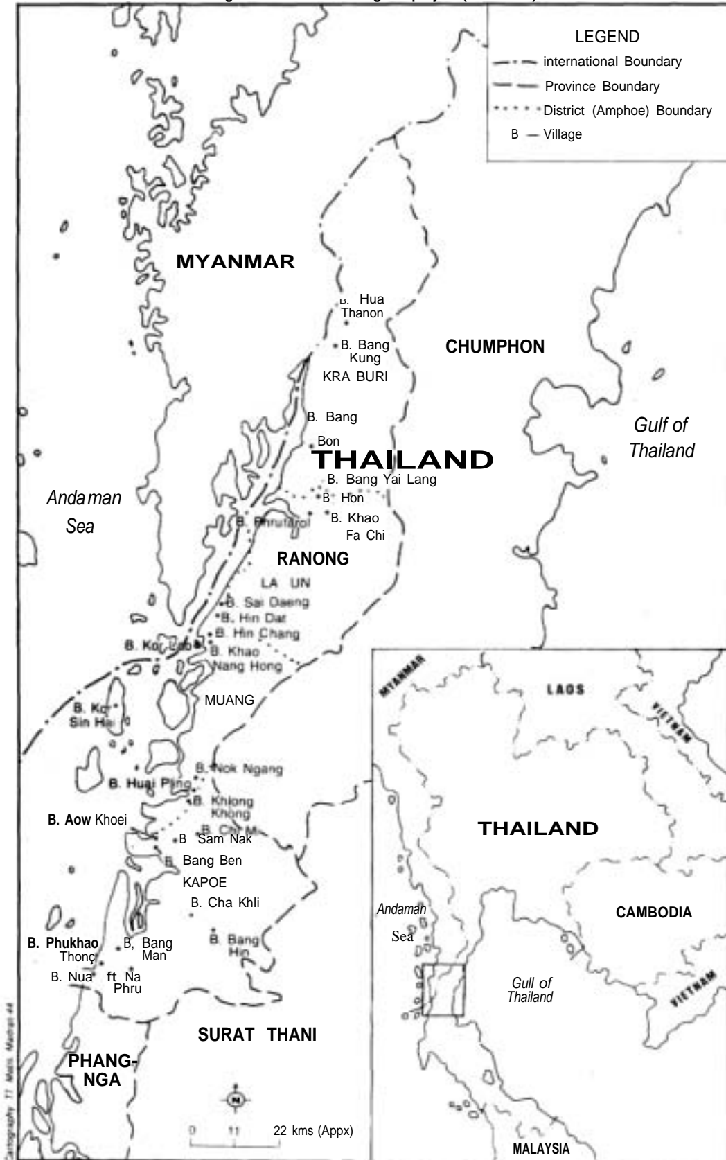
Fig. 1 Map of Ranong Province, Thailand, showing extension service activities implemented in target communities during the project (1987-1990).