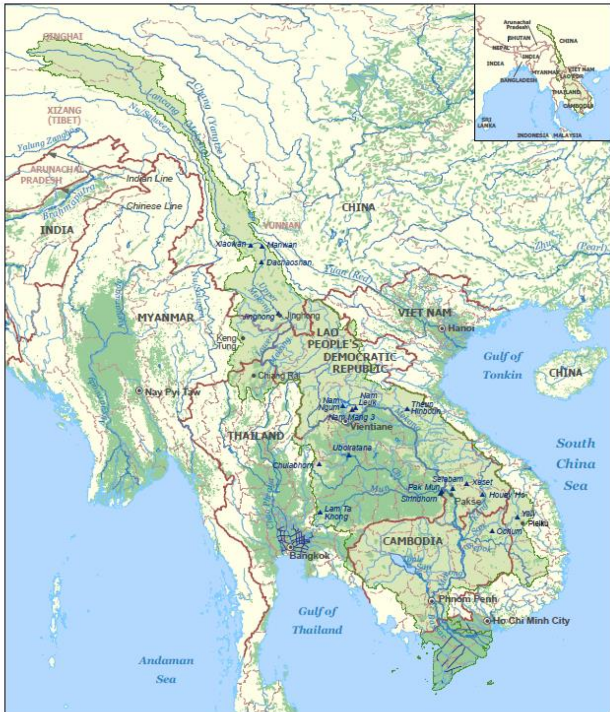
Figure 1 Mekong River Basin